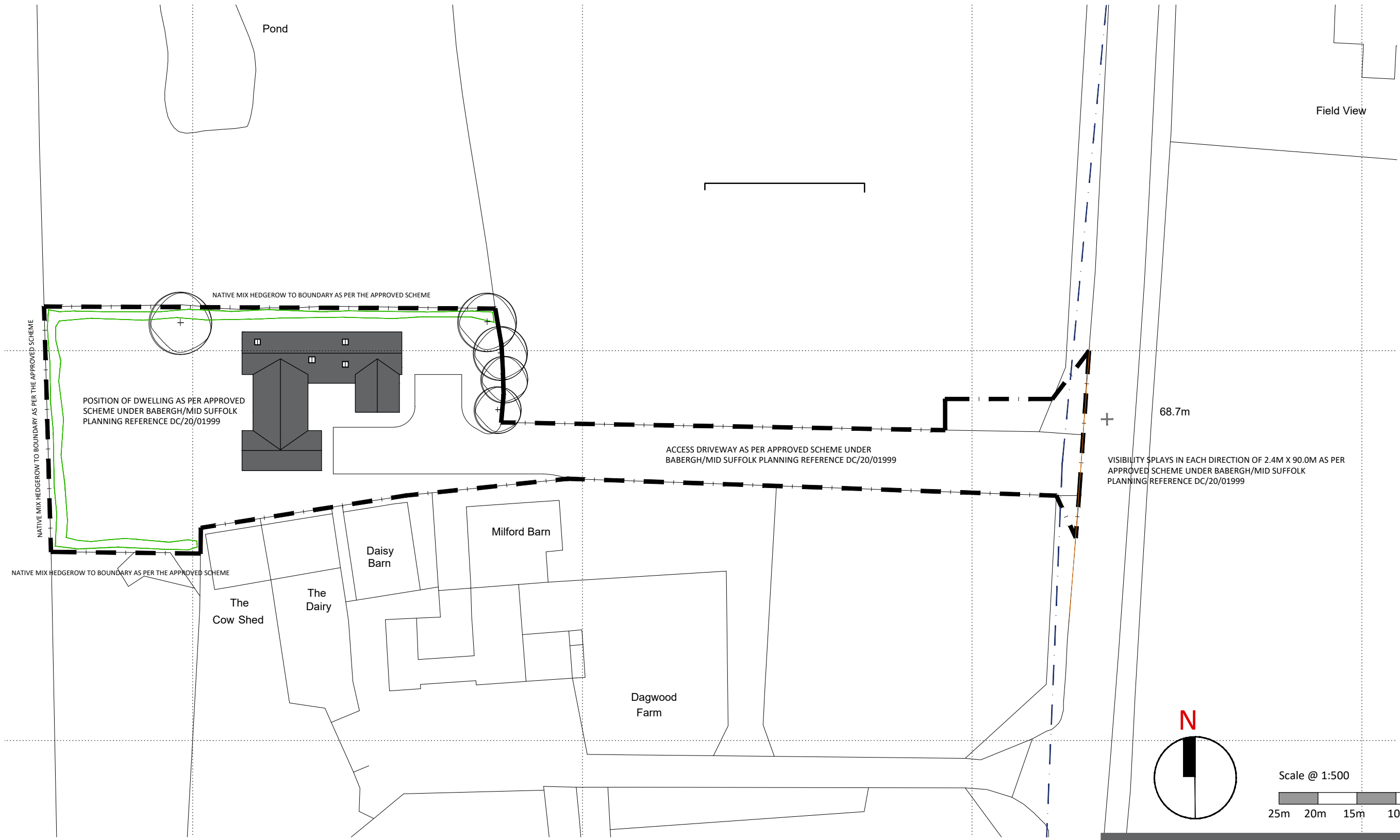
Existing Site Block Plan