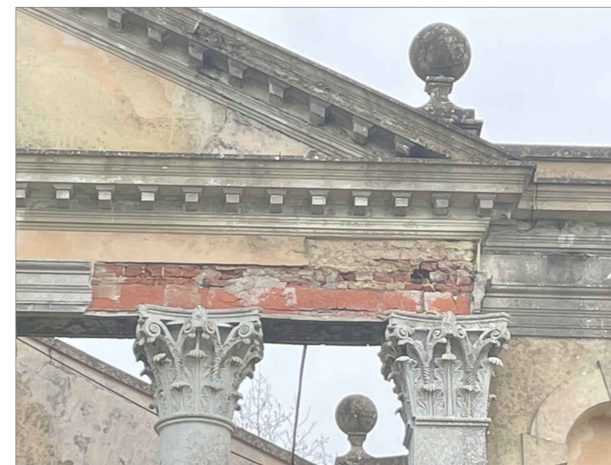
05- Collapsed Section (Dec '23) See detail drawing no. 3878-SK02A for re-render information