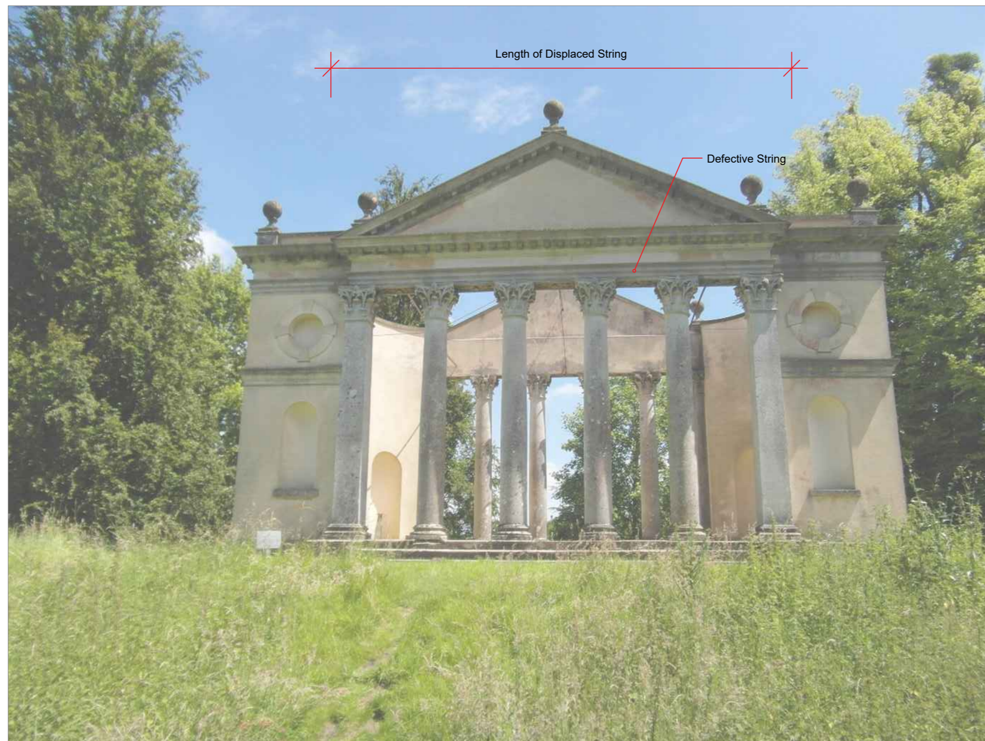
02- General Elevation