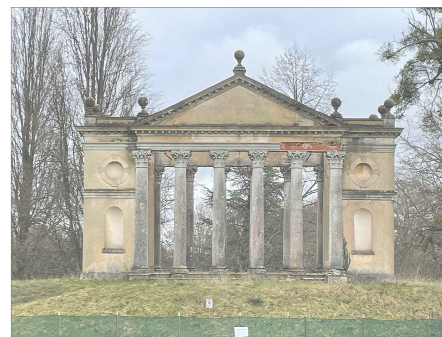
04- General View (Dec '23)