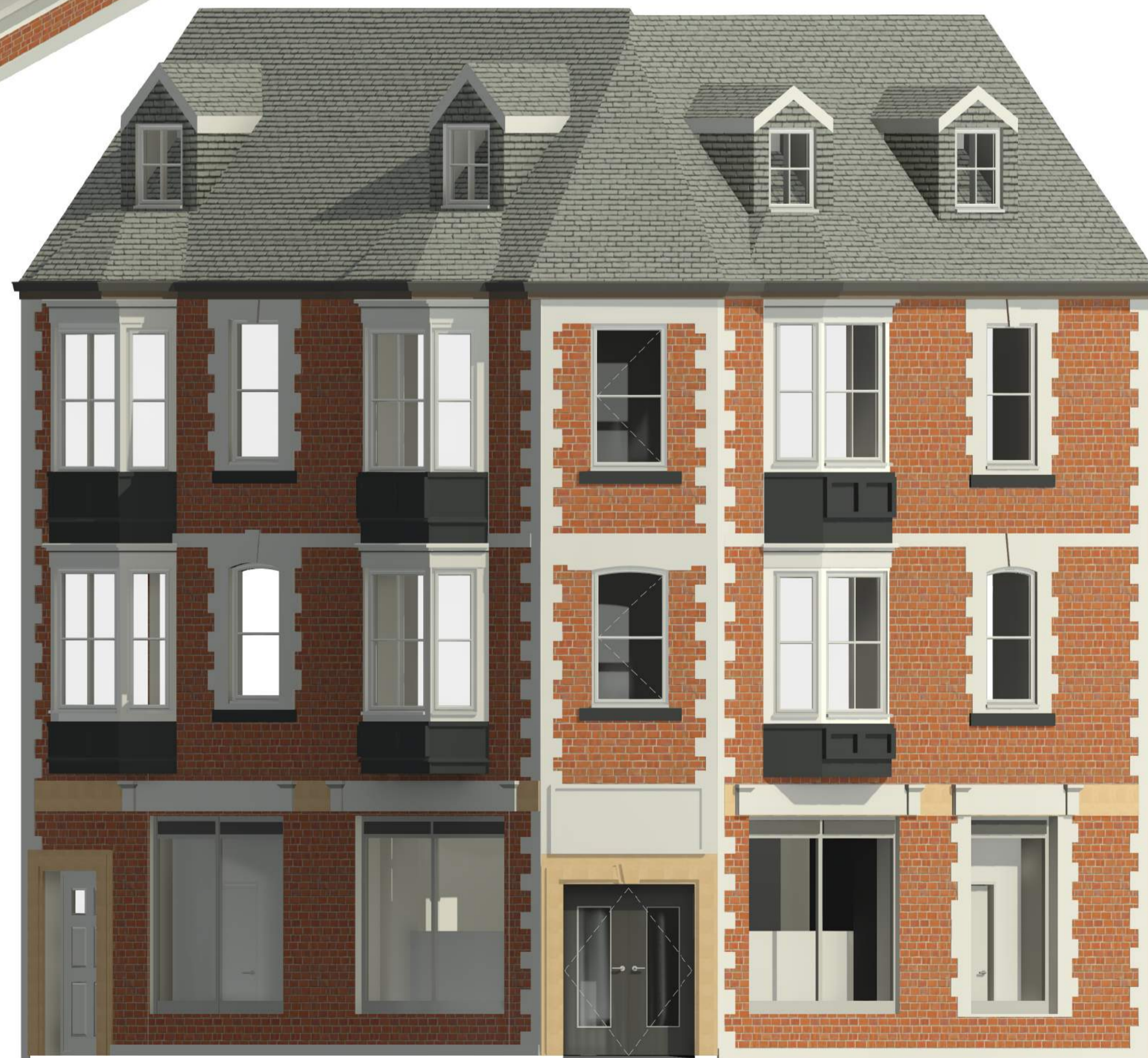
Existing North East Elevation 1 : 50