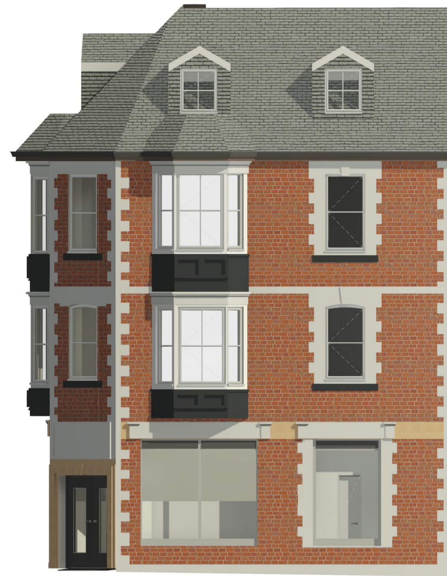
Existing North Elevation 1 : 50