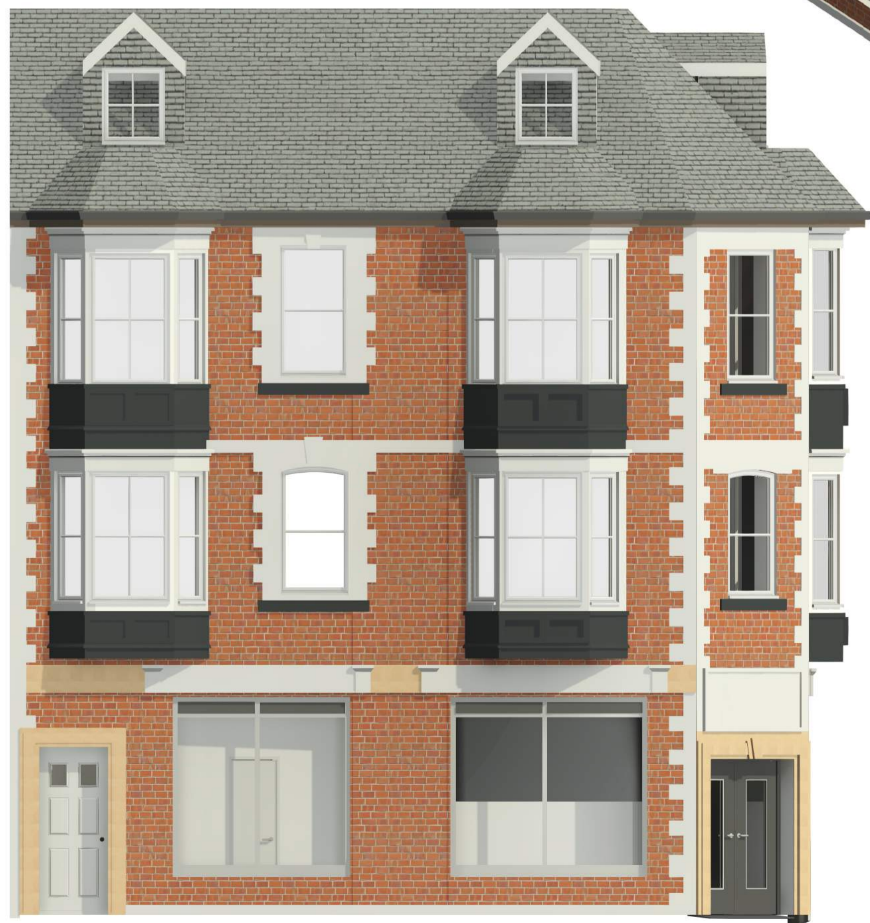
Existing East Elevation 1 : 50