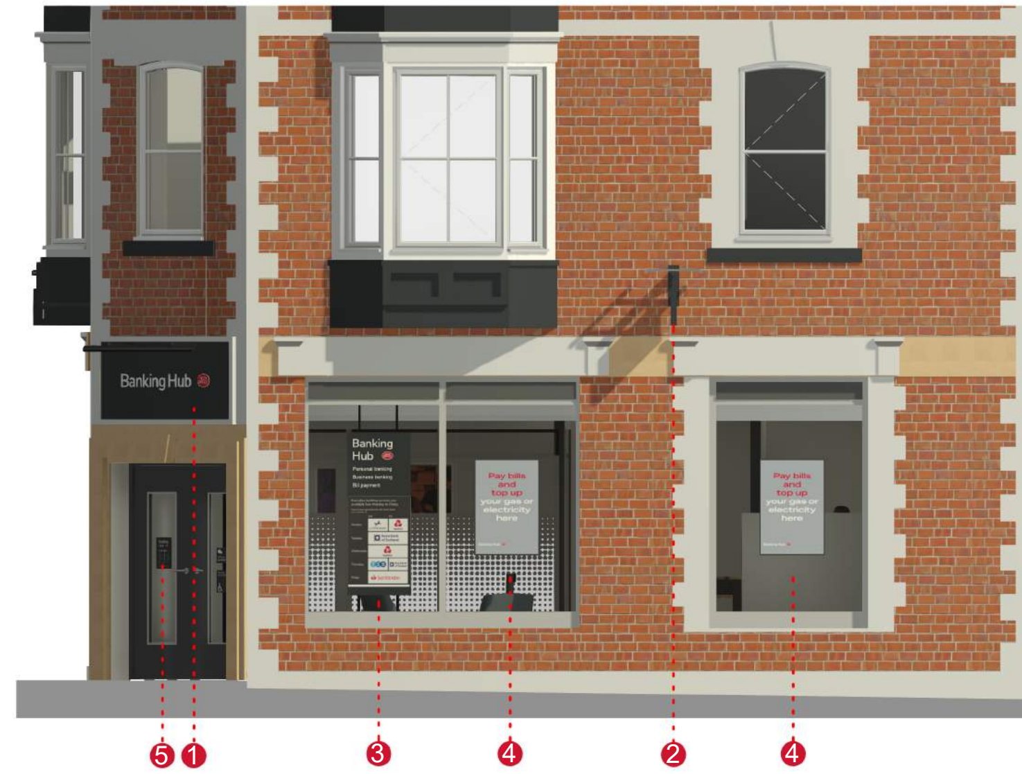
3 Advertisement Side Elevation 1 : 50