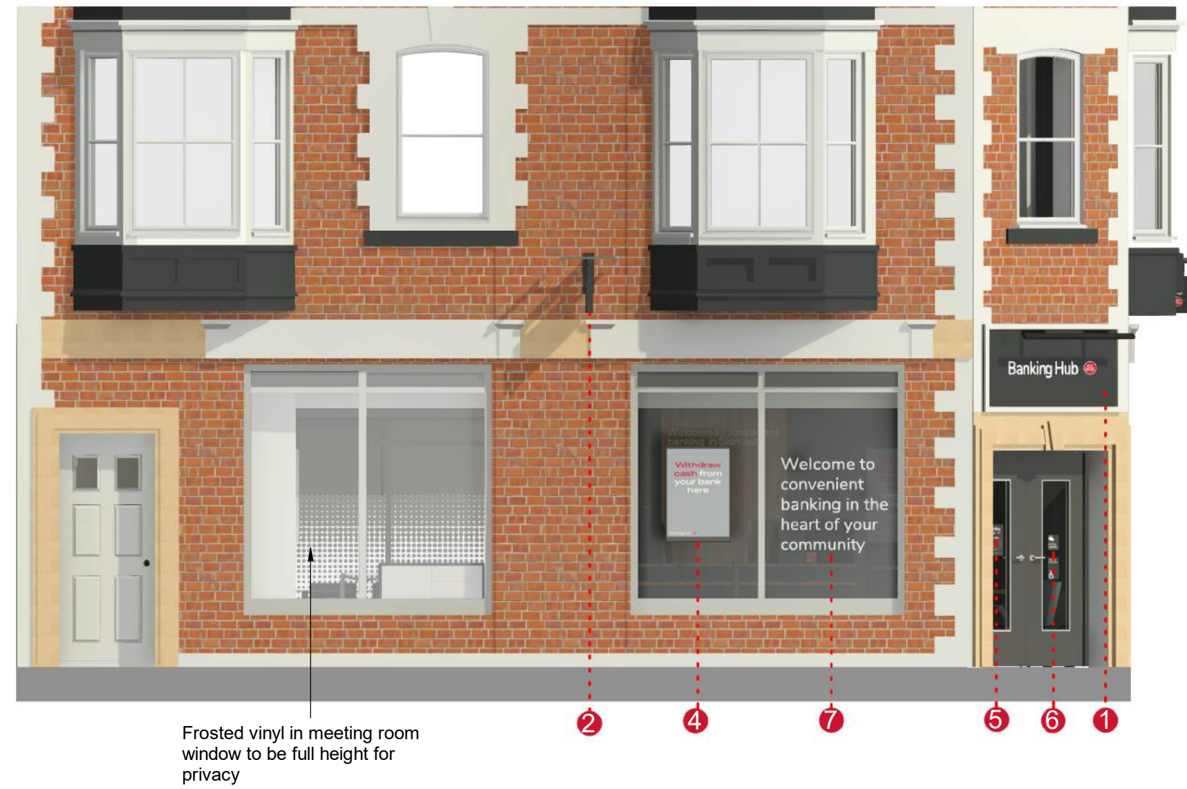
1 Advertisement Front Elevation 1 : 50