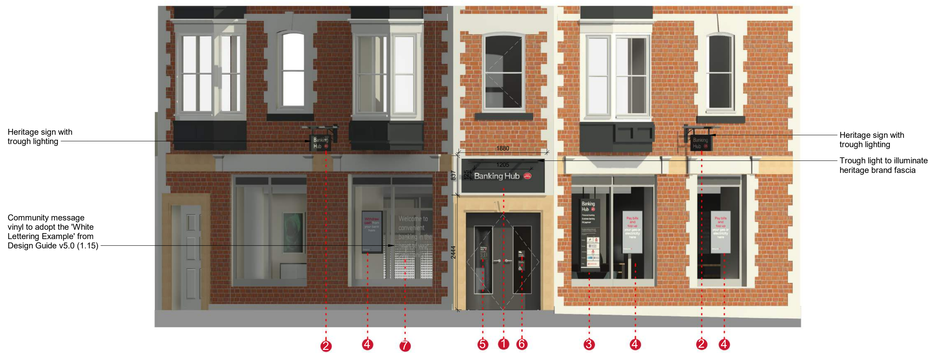
2 Main Entrance 1 : 50