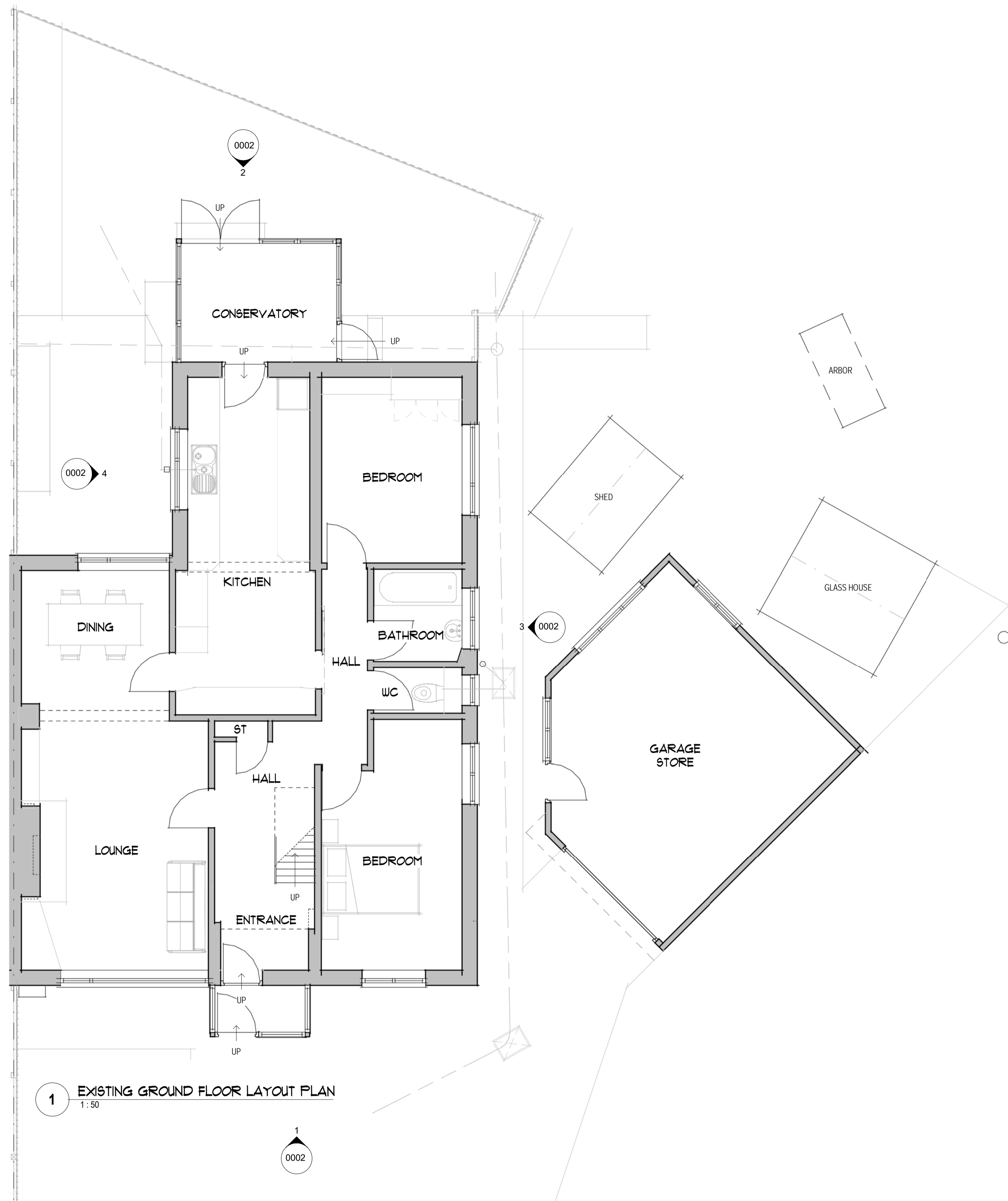
1 EXISTING GROUND FLOOR LAYOUT PLAN 1:50