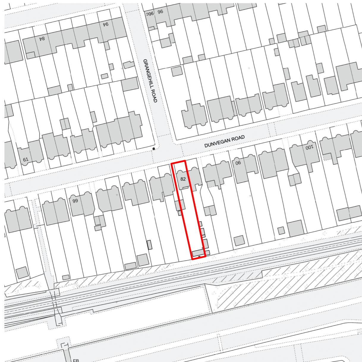
01 LOCATION PLAN SCALE 1:1250

NOTE: 1. Do not scale from these drawings, use dimensions only. 2. Contractors are to check all dimensions prior to commencement on site and notify the architect of any errors, omissions, or discrepancies. 3. Unless otherwise agreed in writing, all rights to use this document are subject to payment in full of all charges. This document may only be used for the express purpose, project and client for which it has been granted and delivered, as notified in writing by Hut and Castle Architects Ltd. This document may not be otherwise used or copied.