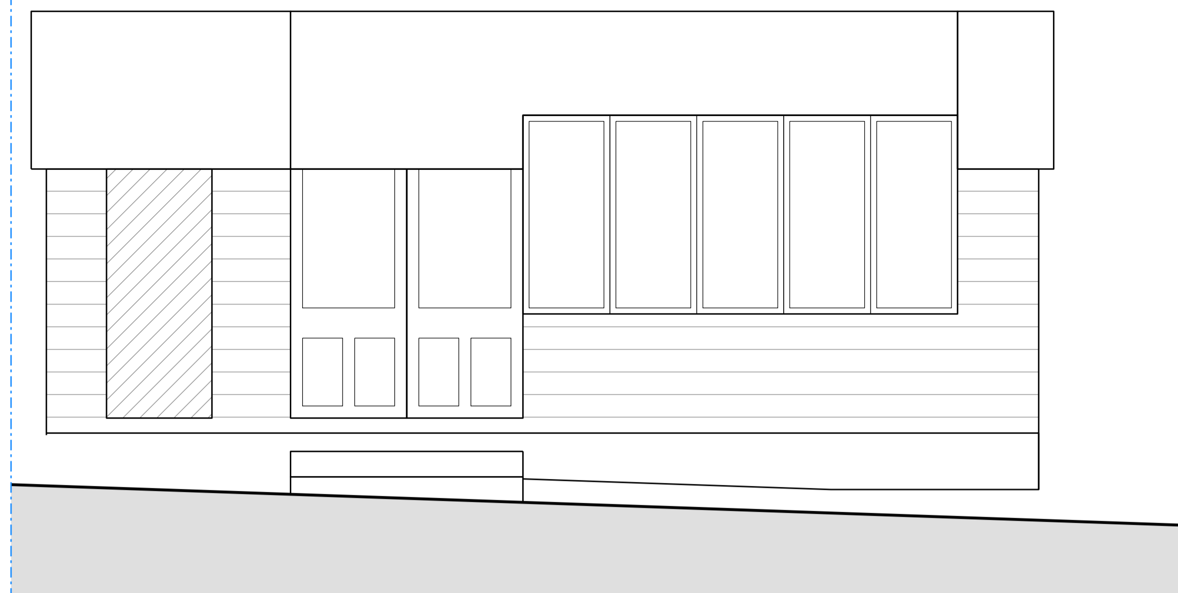
03 NORTH ELEVATION EXISTING