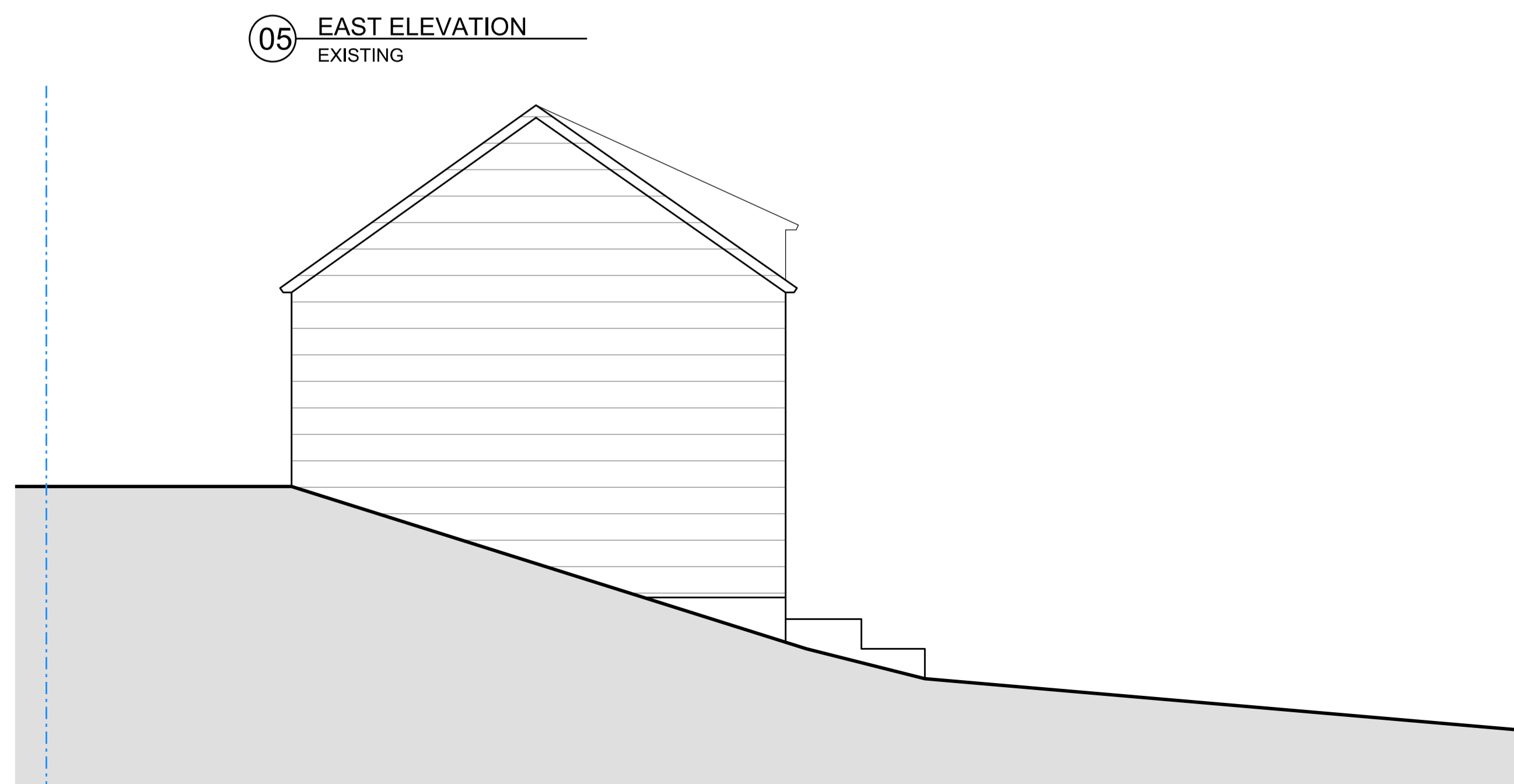
05 EAST ELEVATION EXISTING

Rev Description Date Checked Status PLANNING Client Paul George Address 81 DUNVEGAN ROAD SE9 1SB LONDON Project NEW OUTBUILDING IN THE REAR GARDEN, TO INCLUDE A STORAGE SPACE, AN OFFICE, A STUDIO SPACE AND A SMALL BATHROOM. Drawing EXISTING SECTION & ELEVATIONS Scale Drawn Date Checked 1:25 @ A1 DC 30.01.2024 DC 1:50 @ A3 Project no. Drg Revision 2314 A-11 00 Architect Hut and Castle Architects Ltd T 07891574543 hutandcastle@gmail.com WWW.HUTANDCASTLE.COM