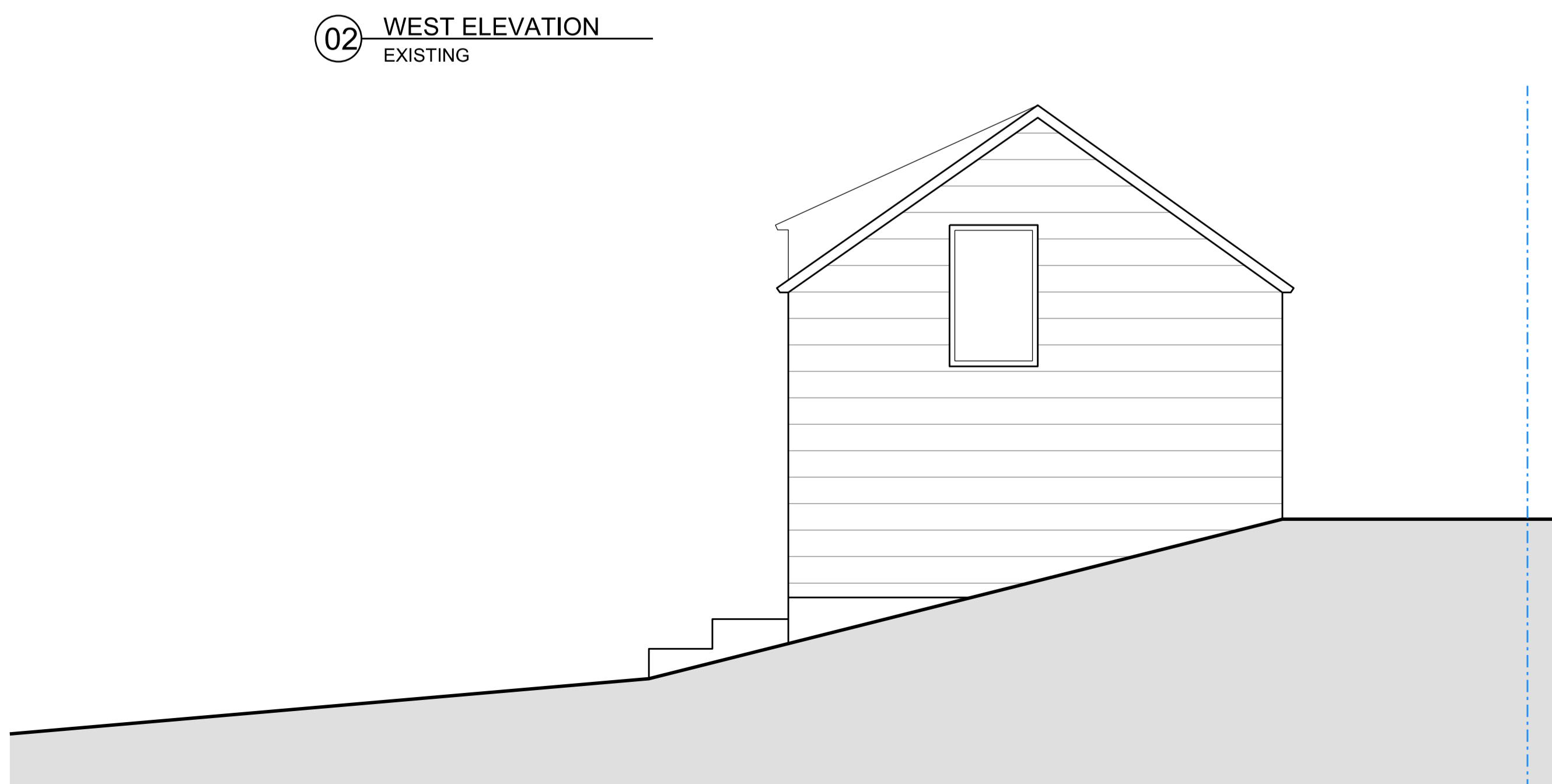
02 WEST ELEVATION EXISTING