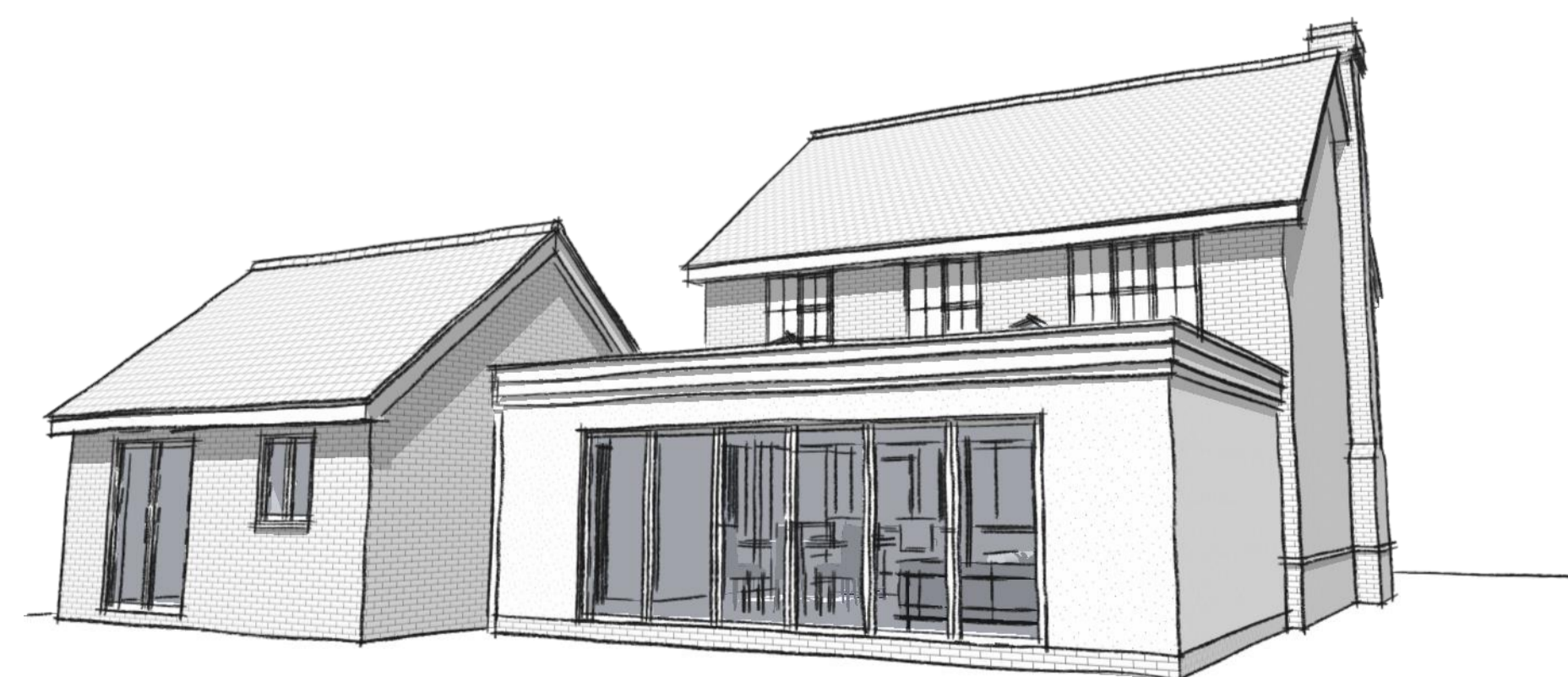
Proposed Exterior Visualisations