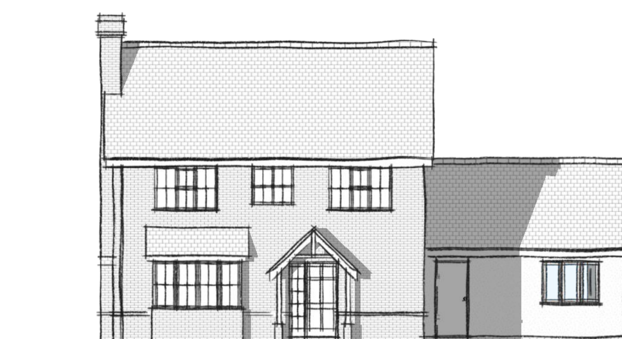
Proposed Front Elevation (1:100)