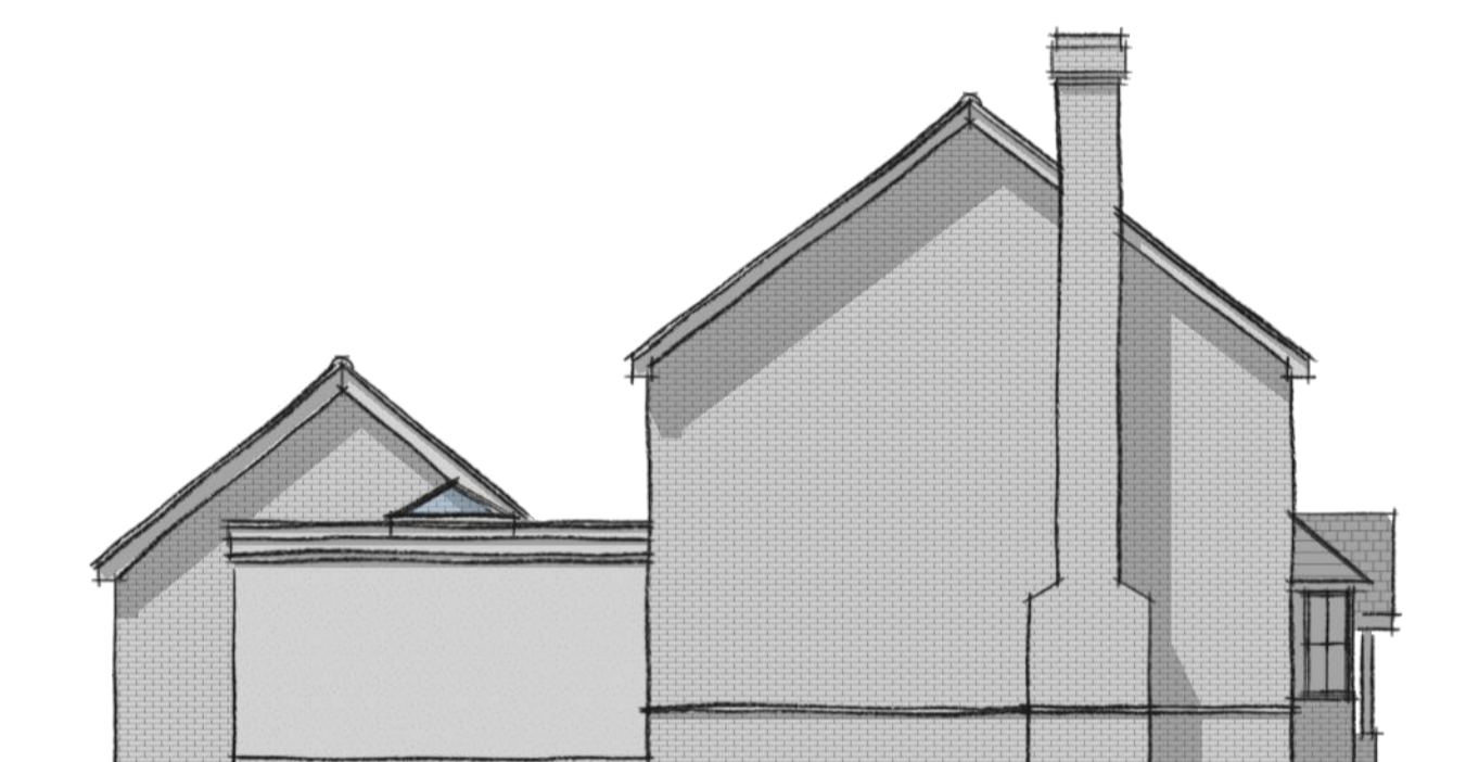
Proposed Left Flank Elevation (1:100)