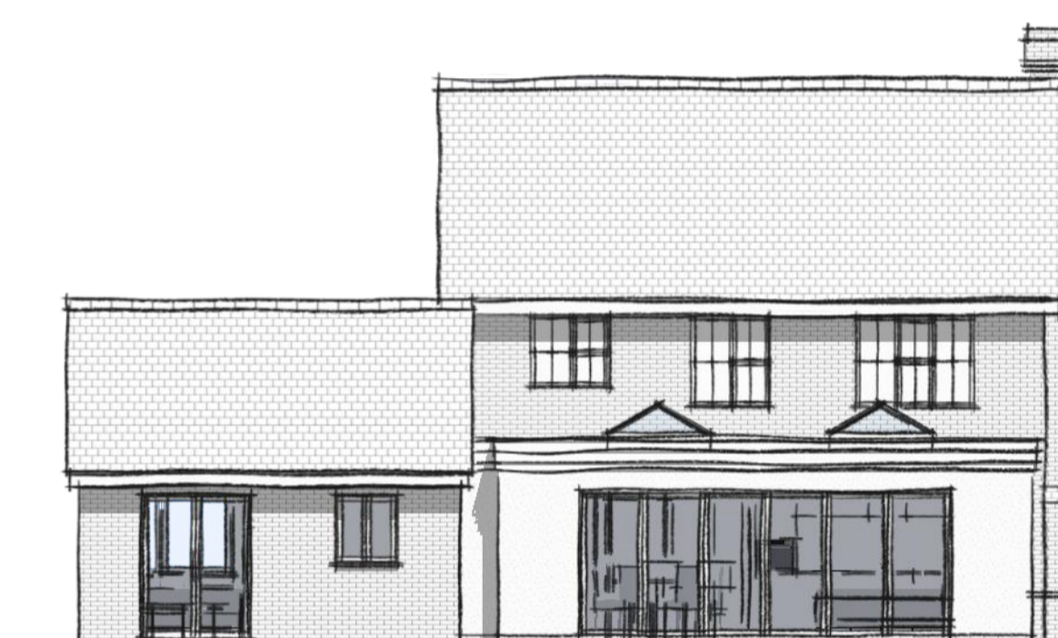
Proposed Rear Elevation (1:100)