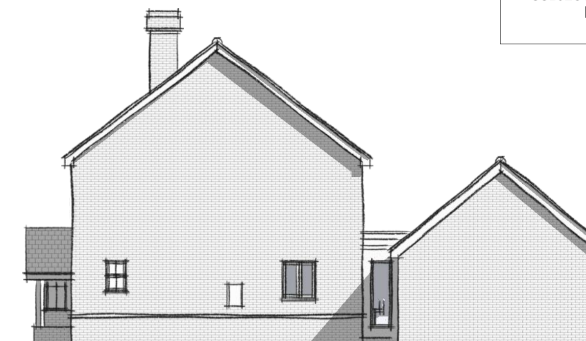
Proposed Right Flank Elevation (1:100)