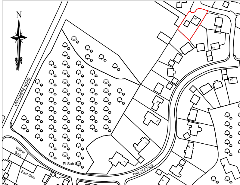
Site Location Plan (1:2500)