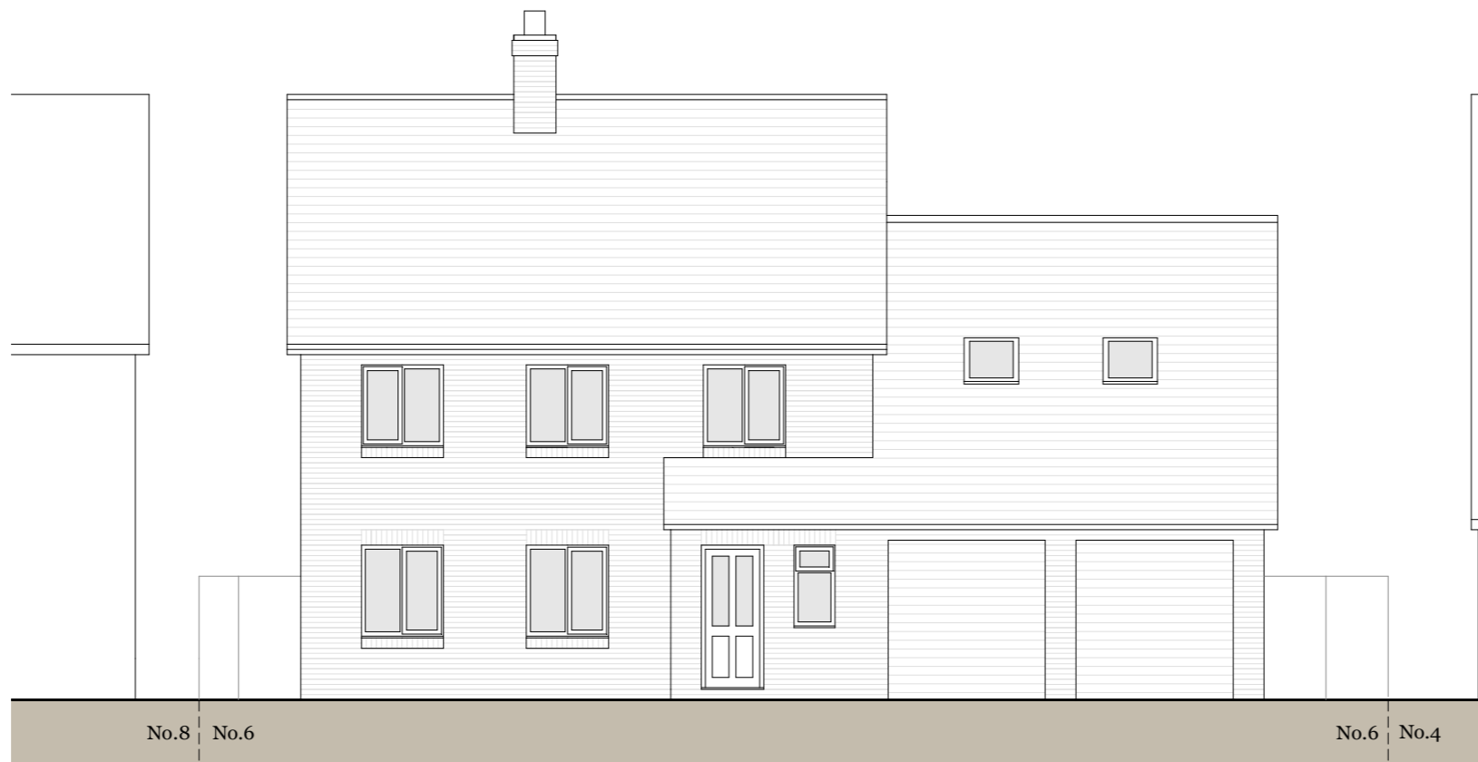
Front Elevation (West)