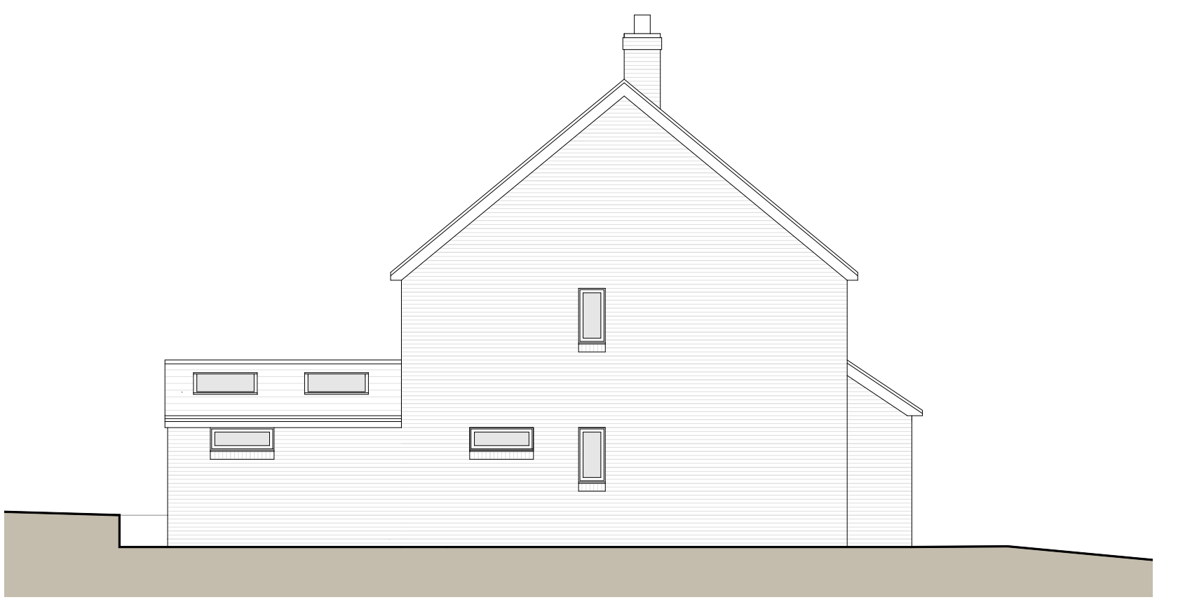
Side Elevation (North)