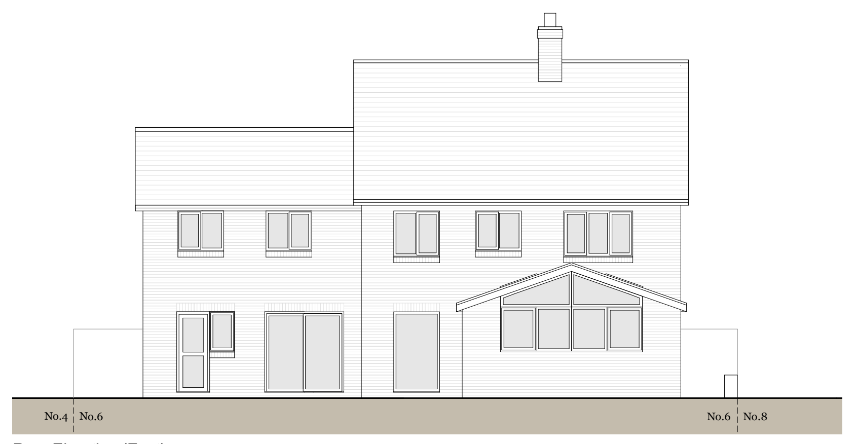
Rear Elevation (East)