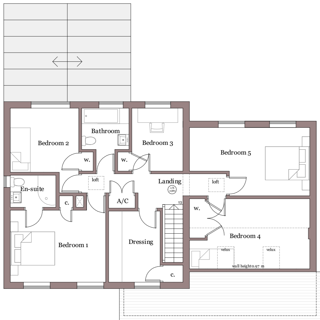
Existing First Floor Plan