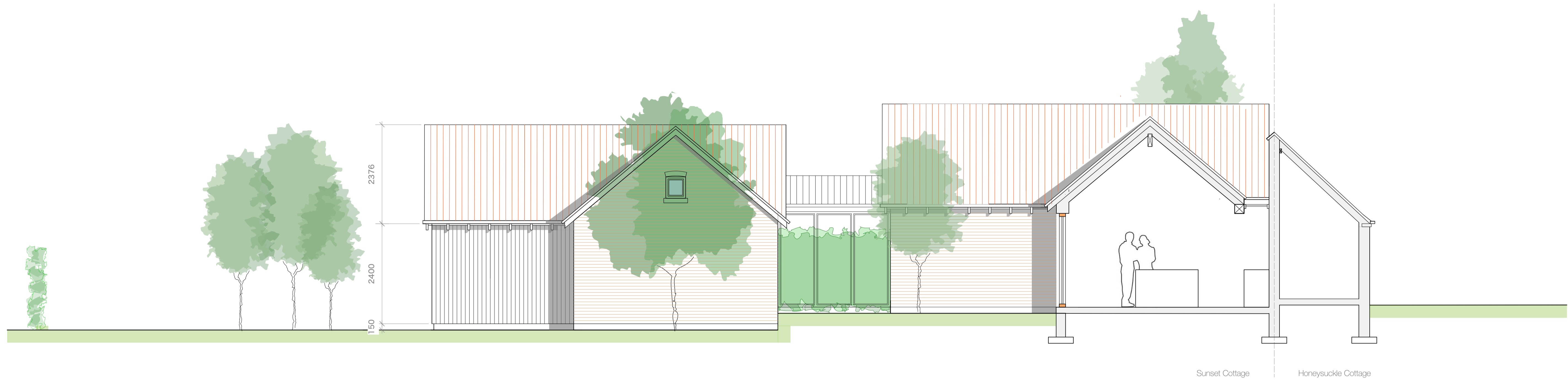
Sunset Cottage Honeysuckle Cottage

Figured dimensions must be taken in preference to scaled dimensions. Any discrepancies must be reported to Stanford Partnership or the relevant Designer. Contractors, sub contractors and suppliers must verify all dimensions on site before commencing any work or making any workshop drawings. All drawings are copyright of Stanford Partnership.