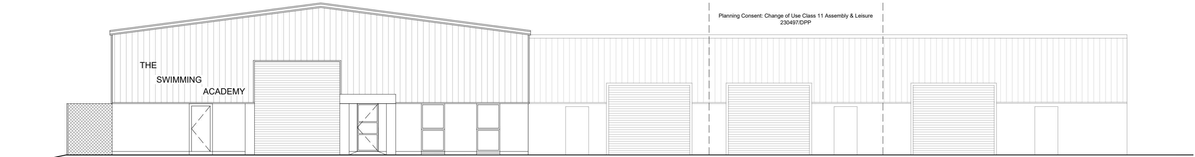
Elevation - East