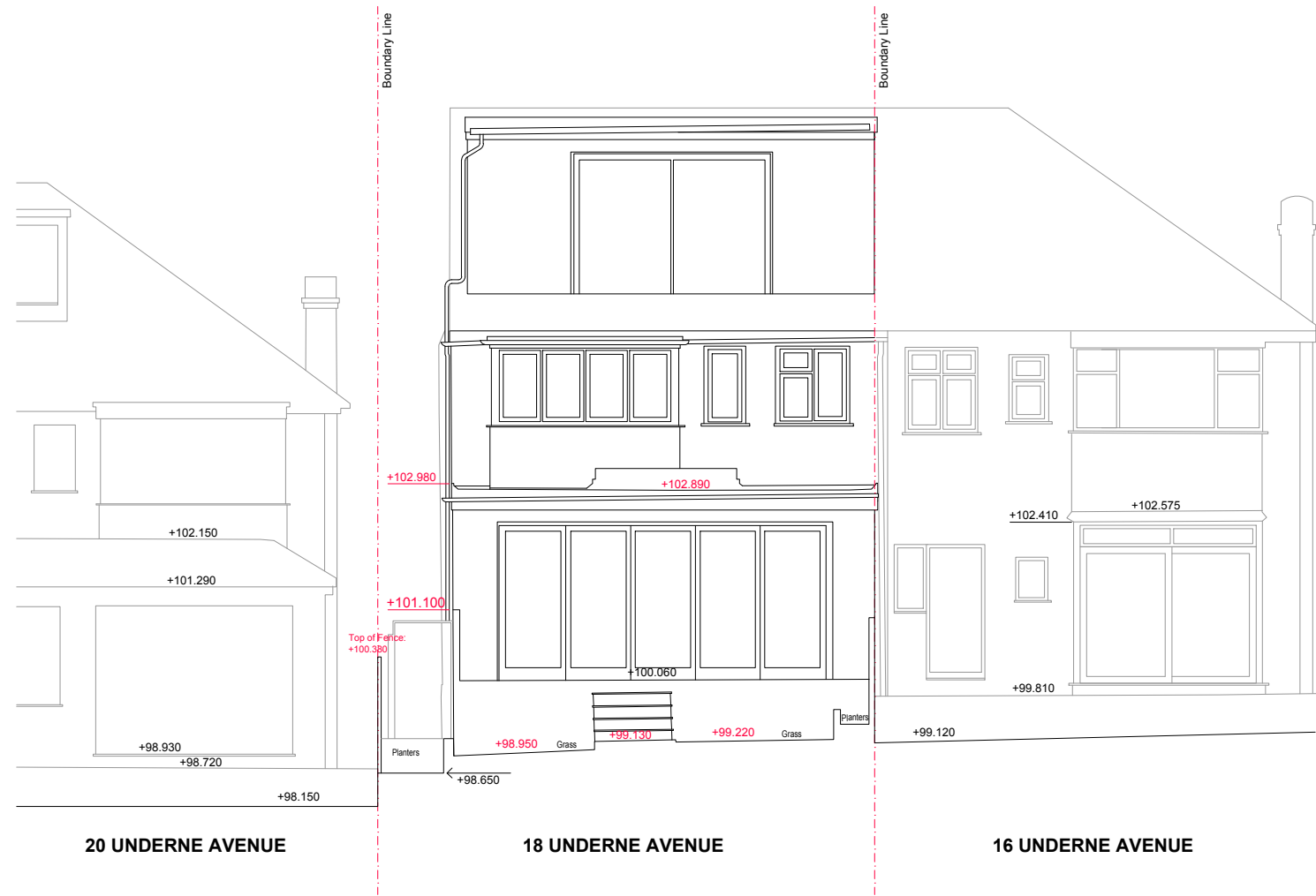
EXISTING REAR ELEVATION (NORTH)