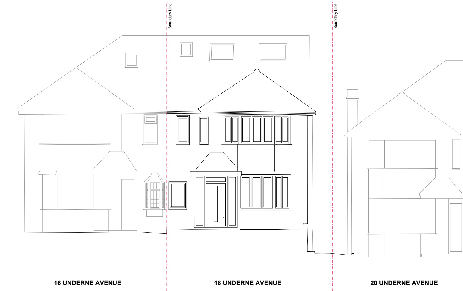
EXISTING FRONT ELEVATION (SOUTH)