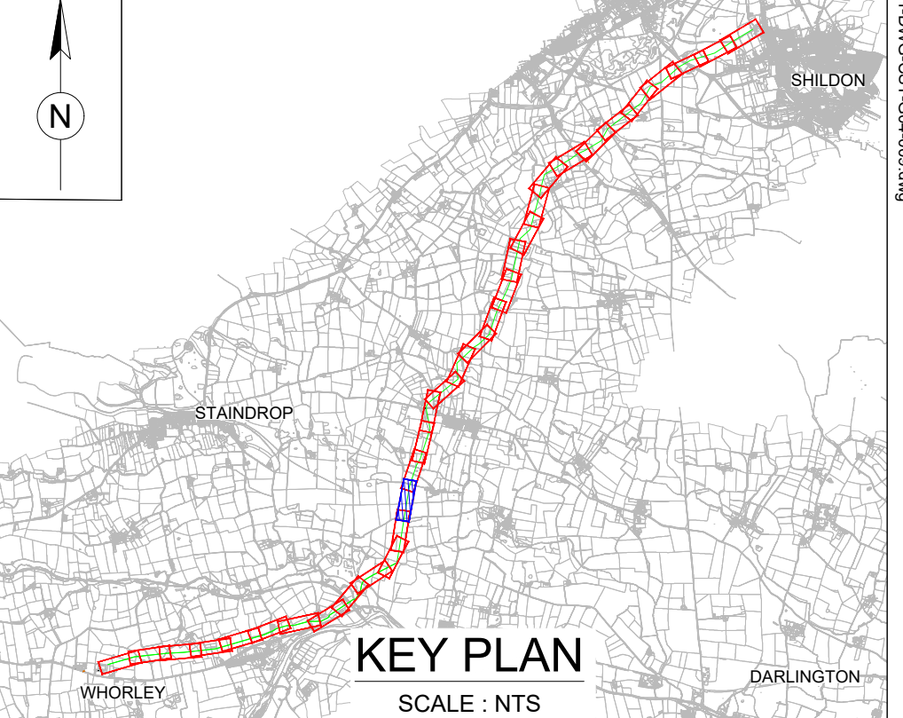
KEY PLAN SCALE : NTS