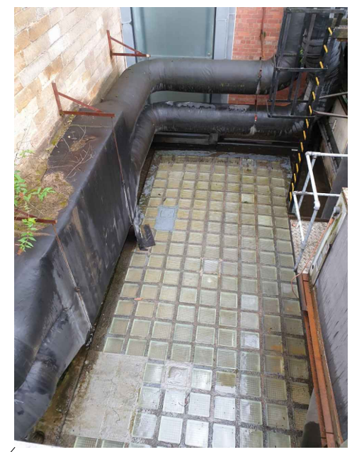
EXISTING GLASS BLOCK SKYLIGHT