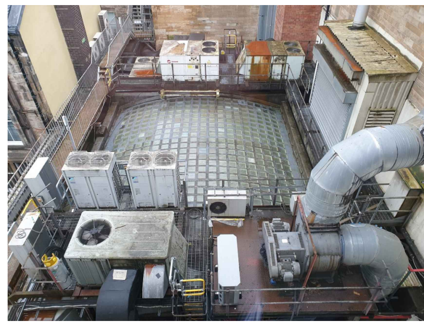
EXISTING PLANT PLATFORMS AND ACCESS WALKWAY