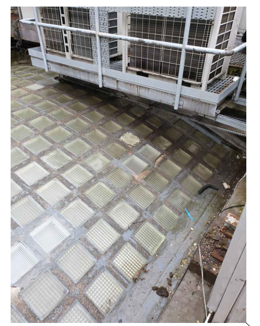
EXISTING GLASS BLOCK SKYLIGHT