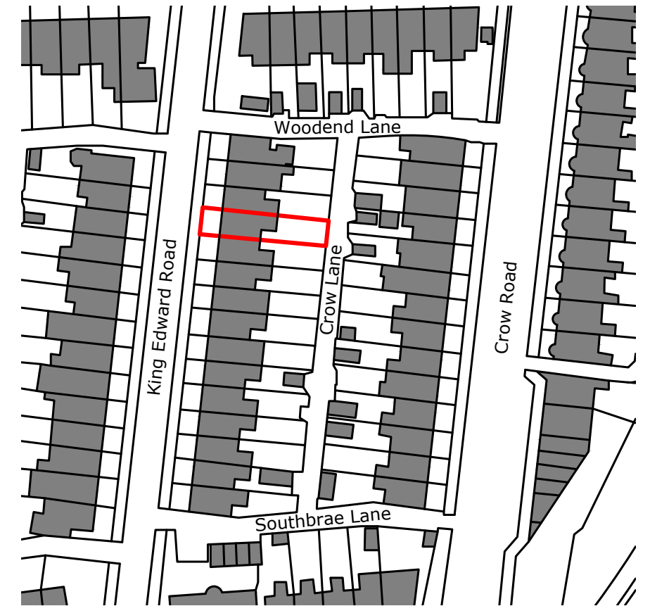
Proposed Location Plan Scale 1:1250