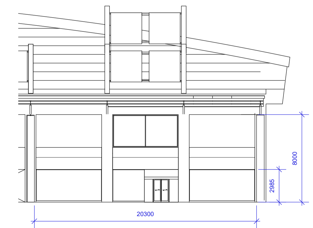
EXISTING SHOPFRONT SCALE 1:200