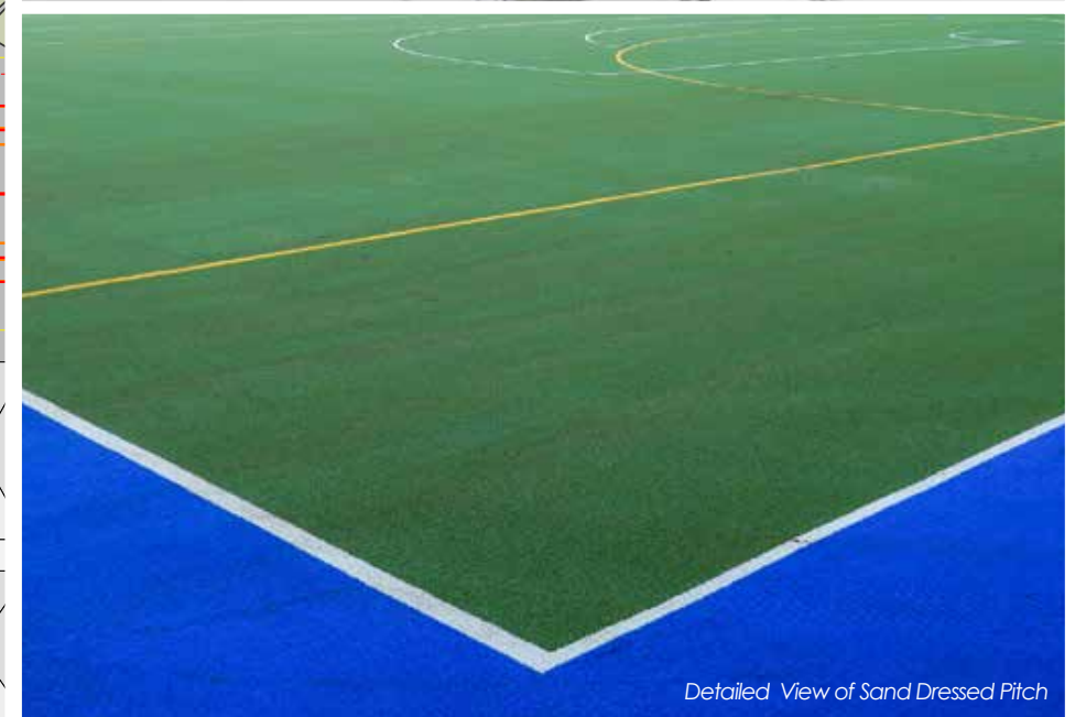
Detailed View of Sand Dressed Pitch