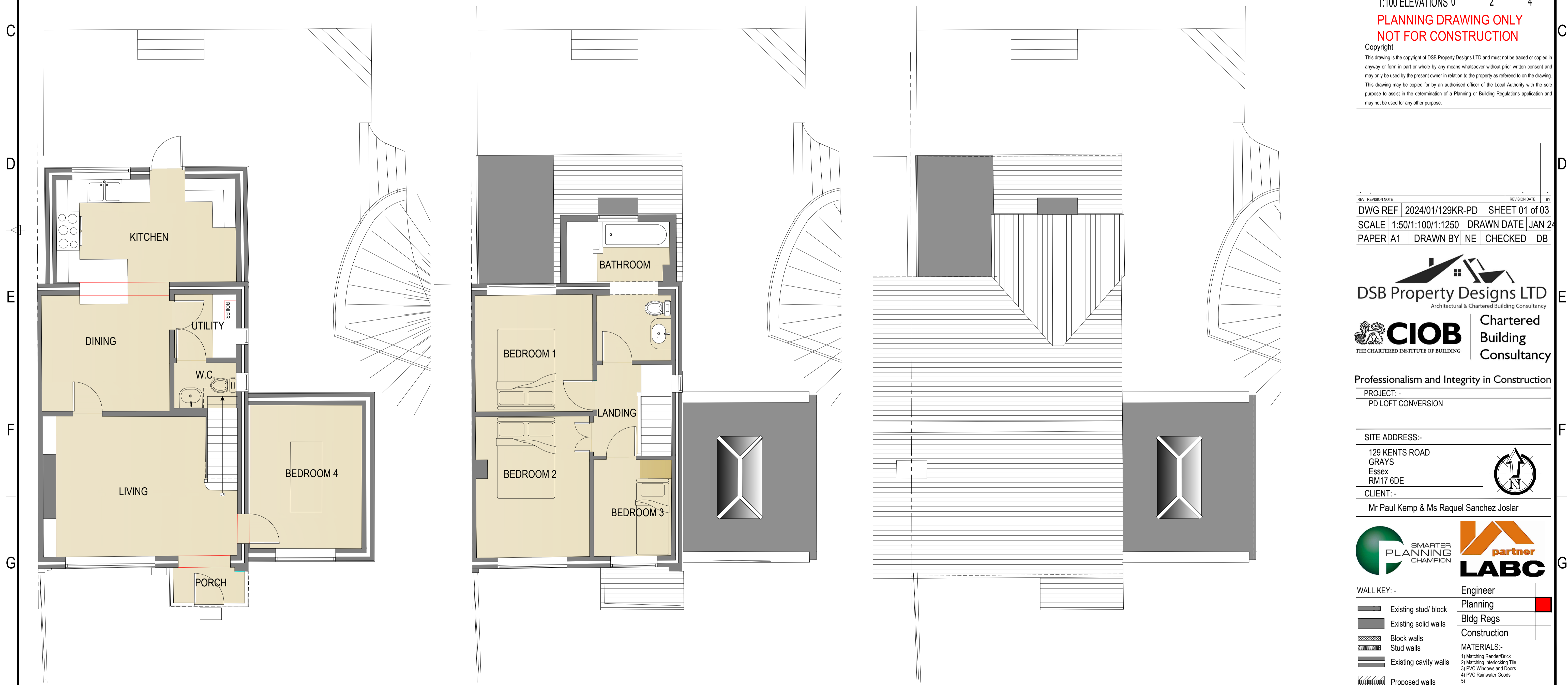
05 Existing Ground Floor Plan 1:50

Tel: 01702 302 399 Email: Info@dsbdesigns.co.uk Web: www.dsbdesigns.co.uk