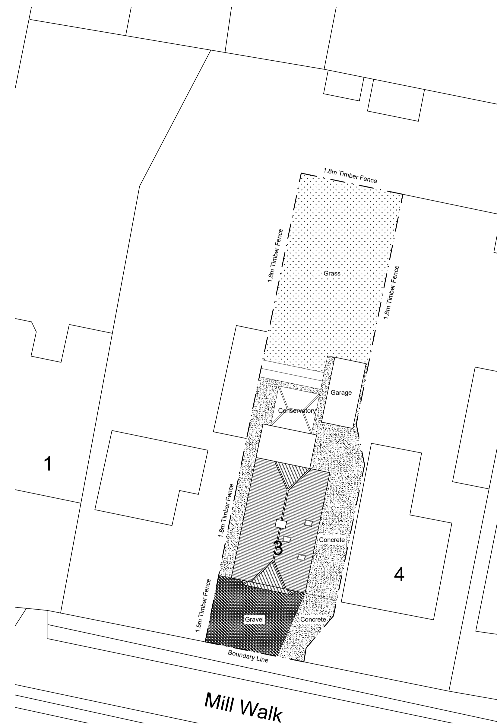
As Built Block Plan - 1:200