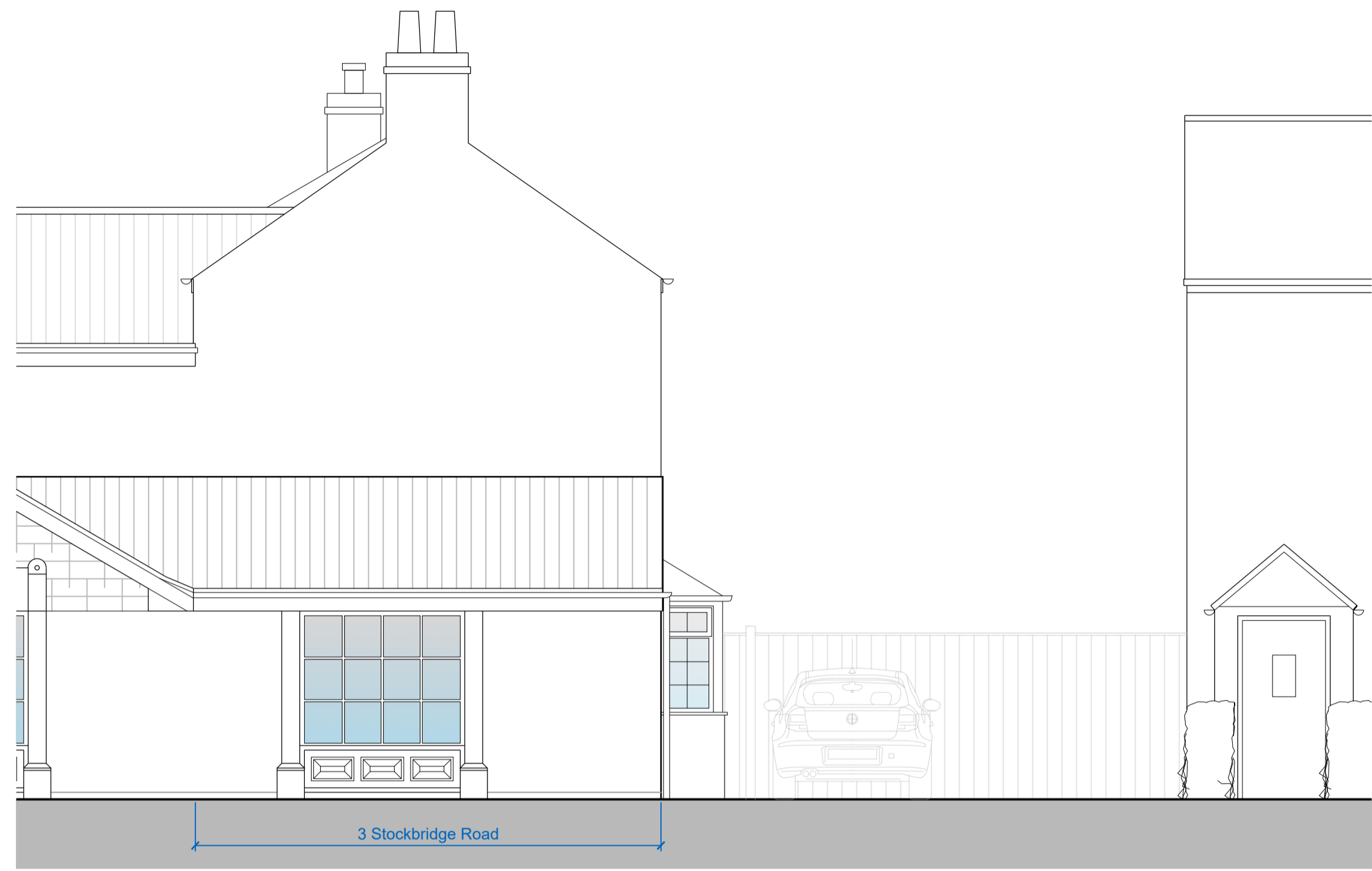
Existing North Facing Elevation