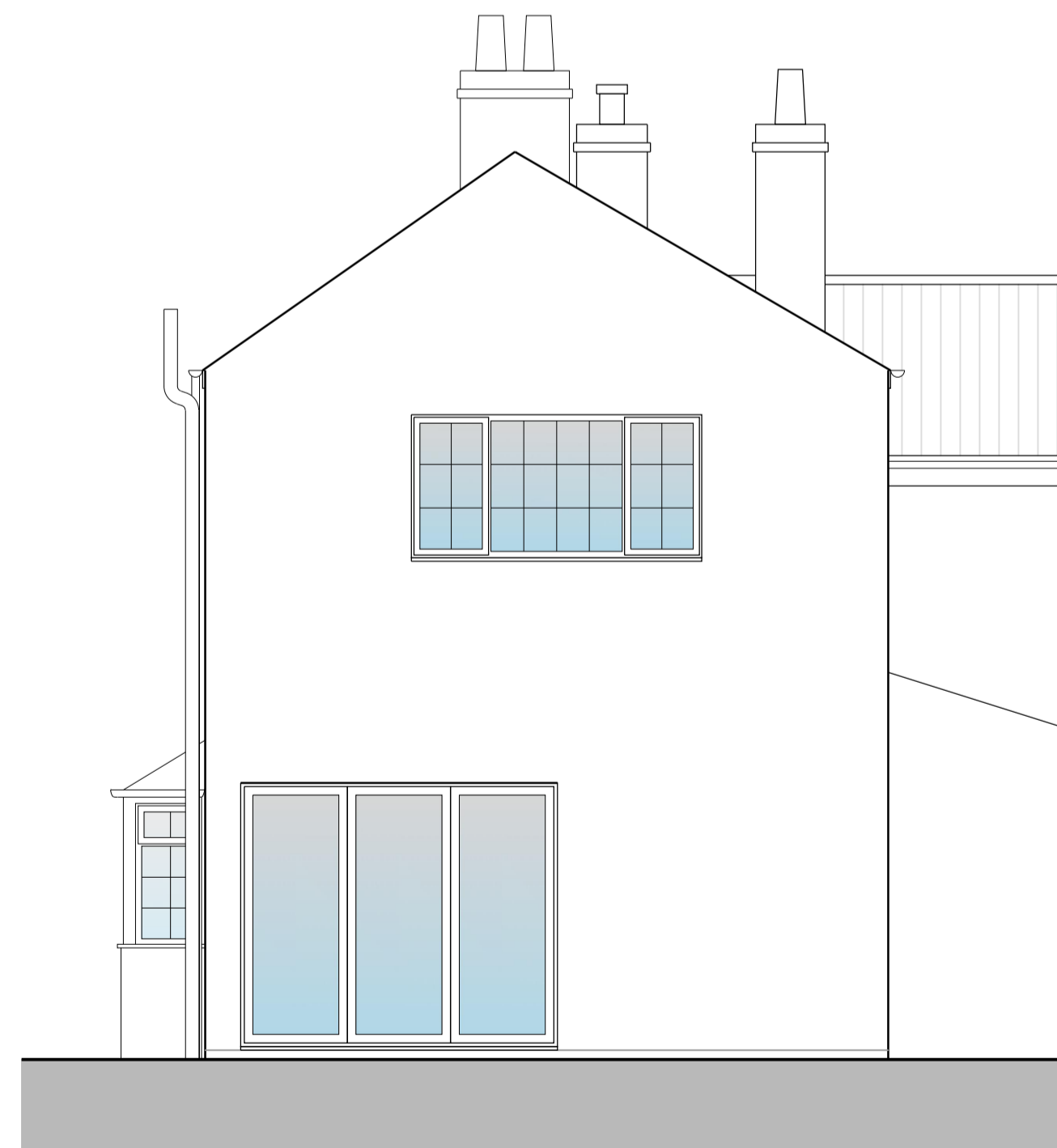
Existing South Facing Elevation