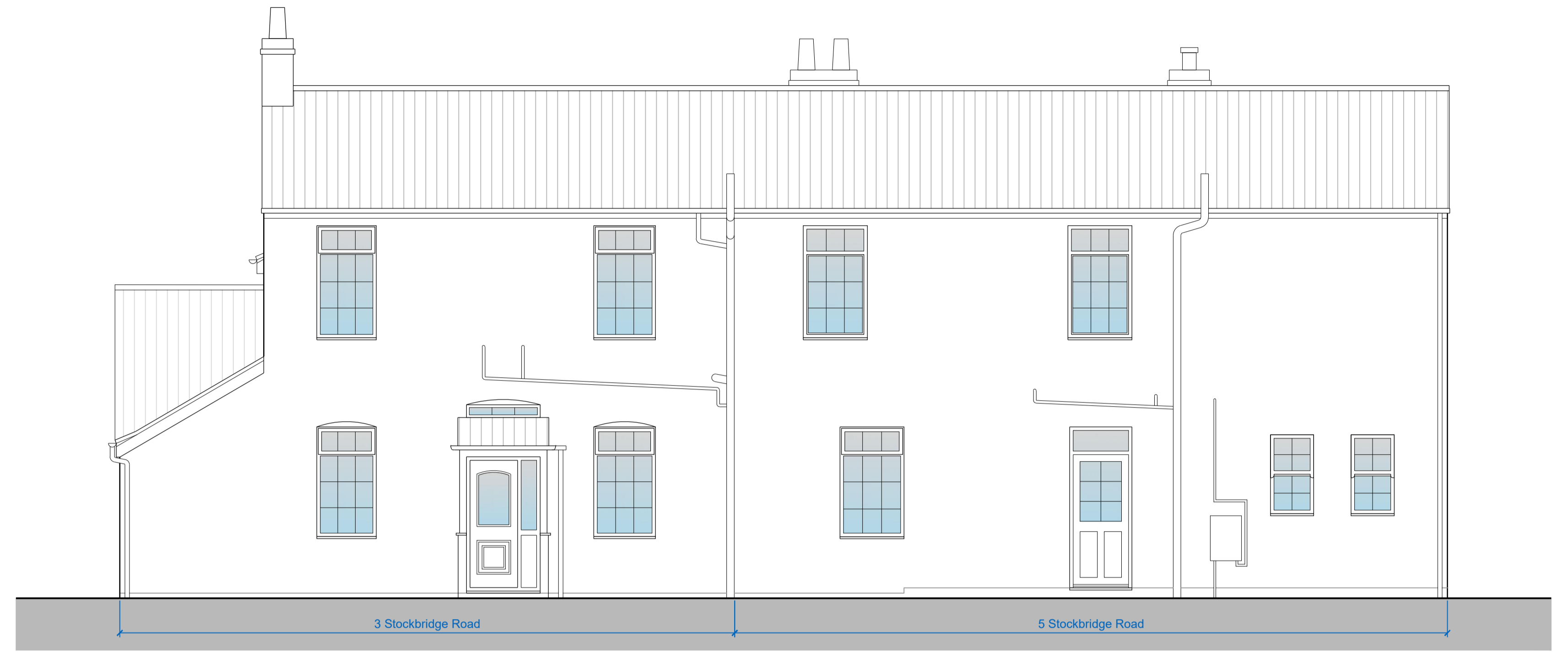
Existing West Facing Elevation