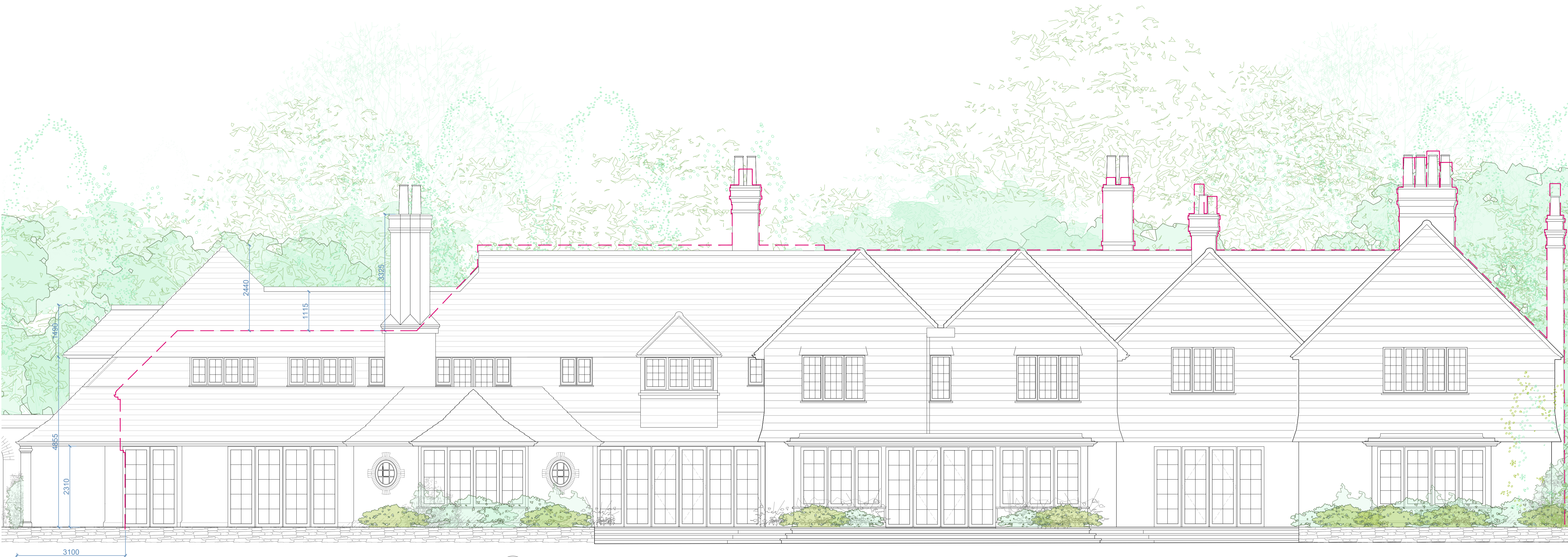
1 PROPOSED REAR/GARDEN ELEVATION: C-C P13 1:50 @ A1