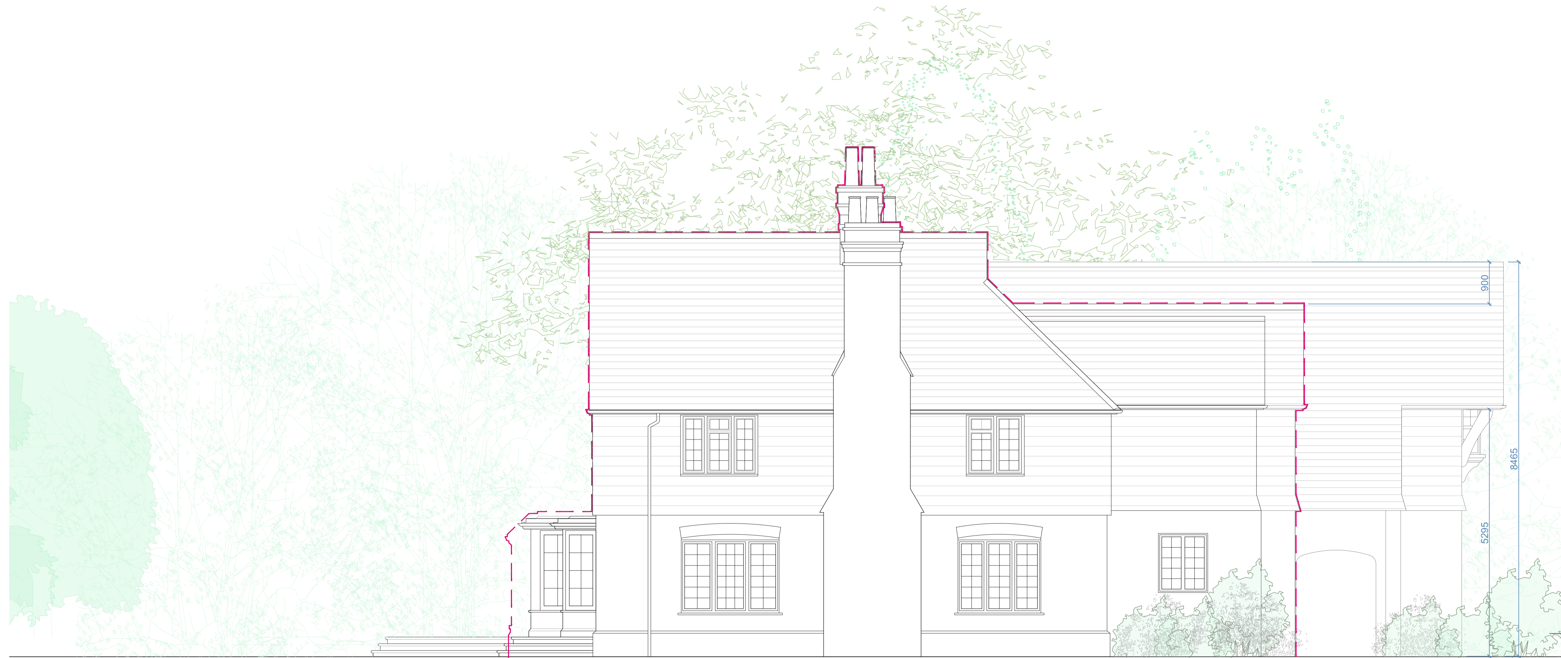
1 PROPOSED EAST SIDE ELEVATION: D-D P14 1:50 @ A1