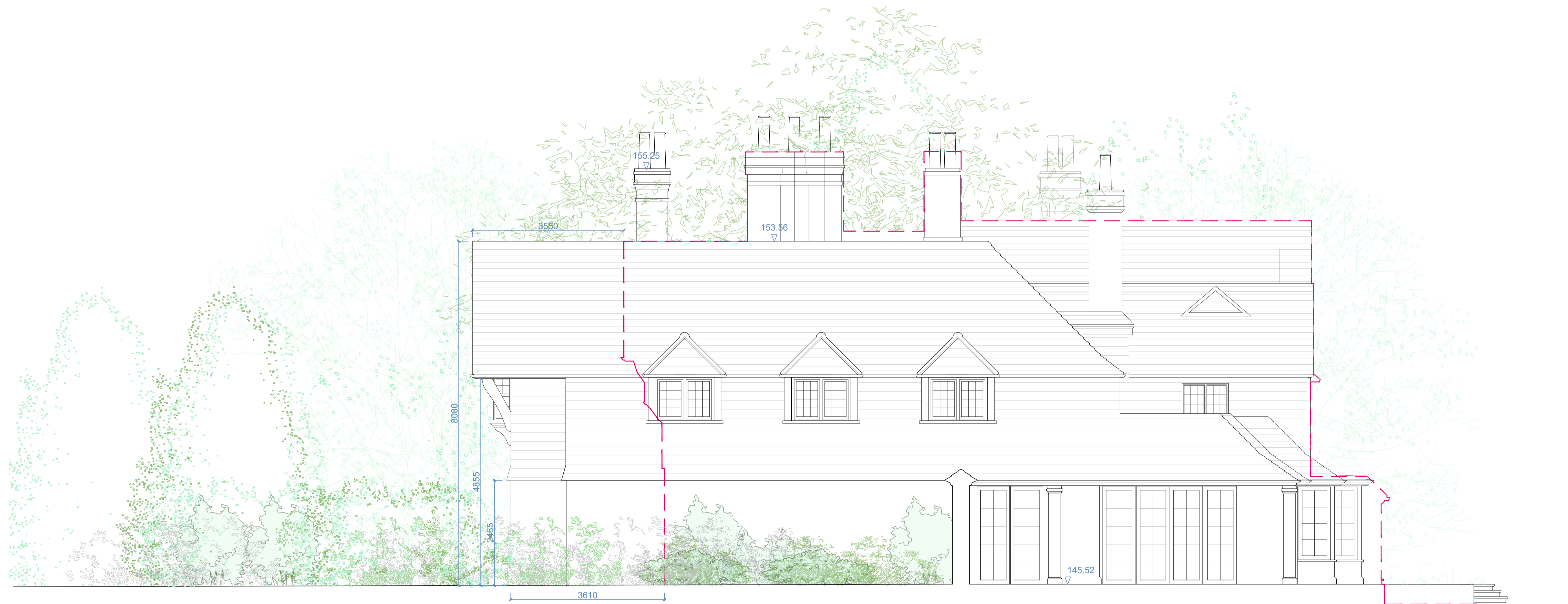
1 PROPOSED WEST SIDE ELEVATION: B-B P16 1:50 @ A1