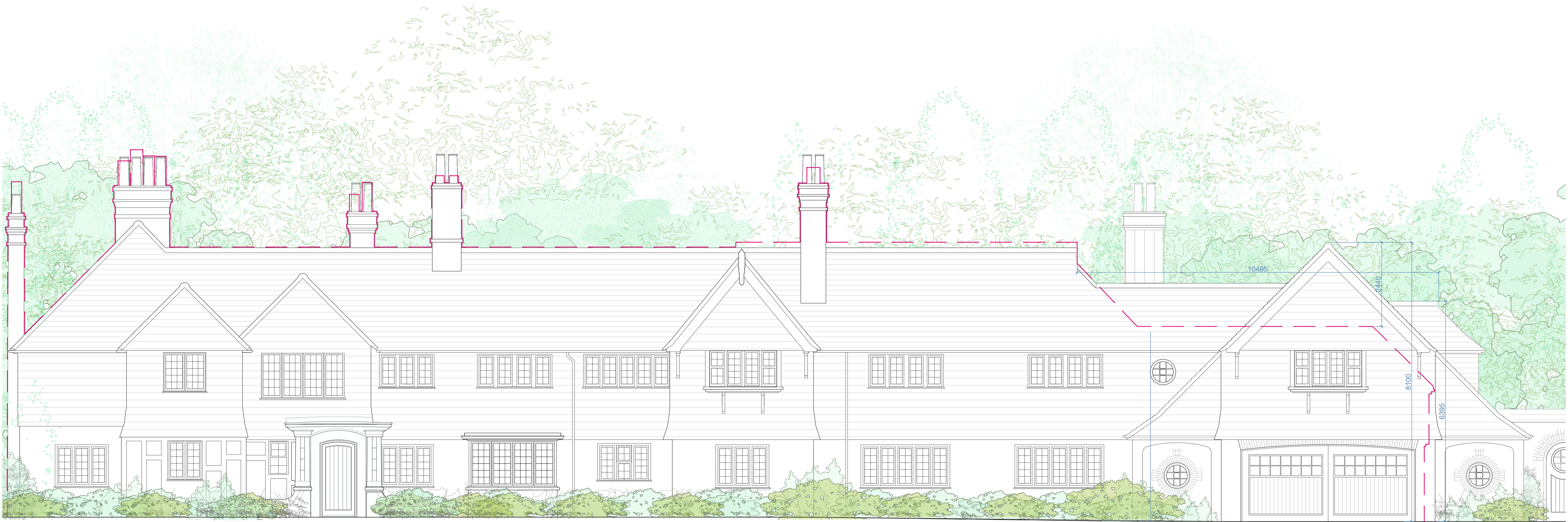
1 PROPOSED FRONT ELEVATION: A-A P15 1:50 @ A1