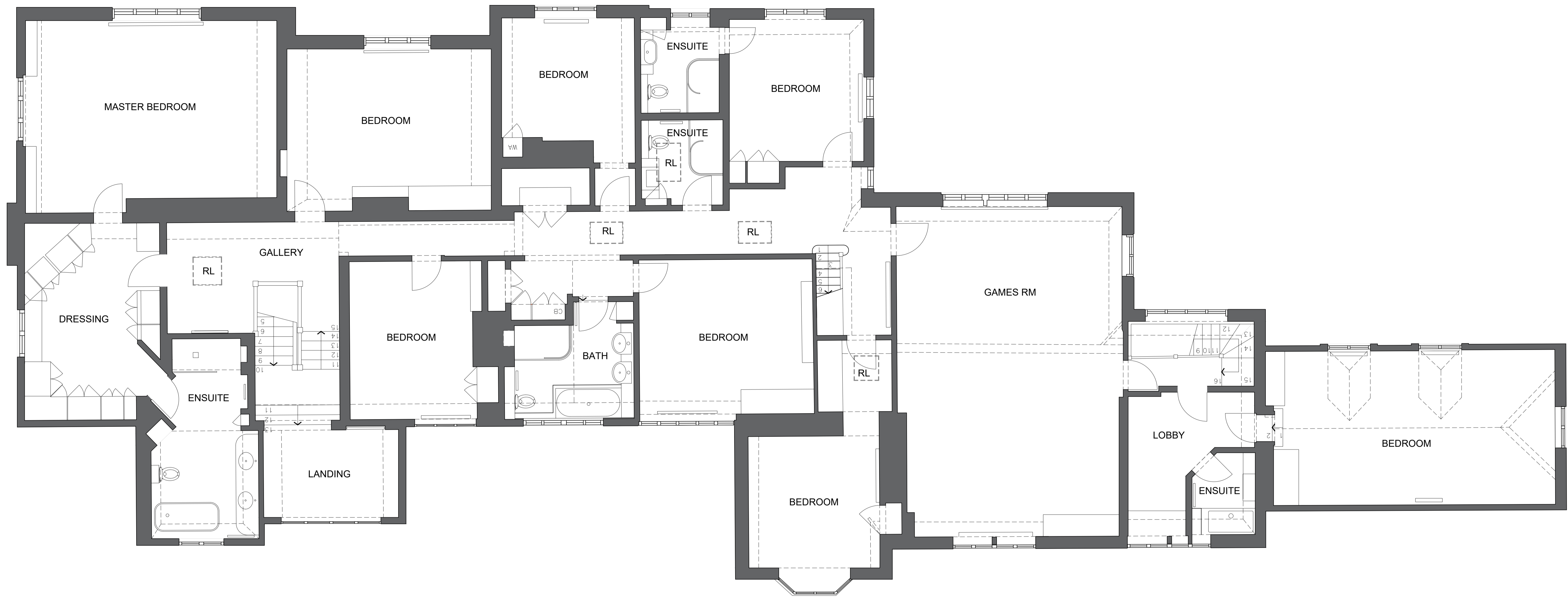
EXISTING FIRST FLOOR PLAN 1:50 @ A1