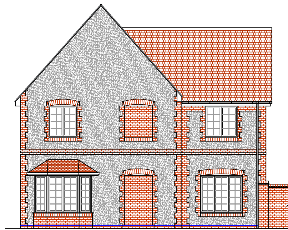
Existing LH Side Elevation