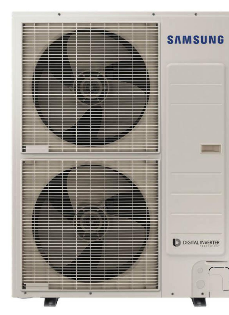
ASHP FRONT ELEVATION

A LISTED BUILDING CONSENT REV DESCRIPTION