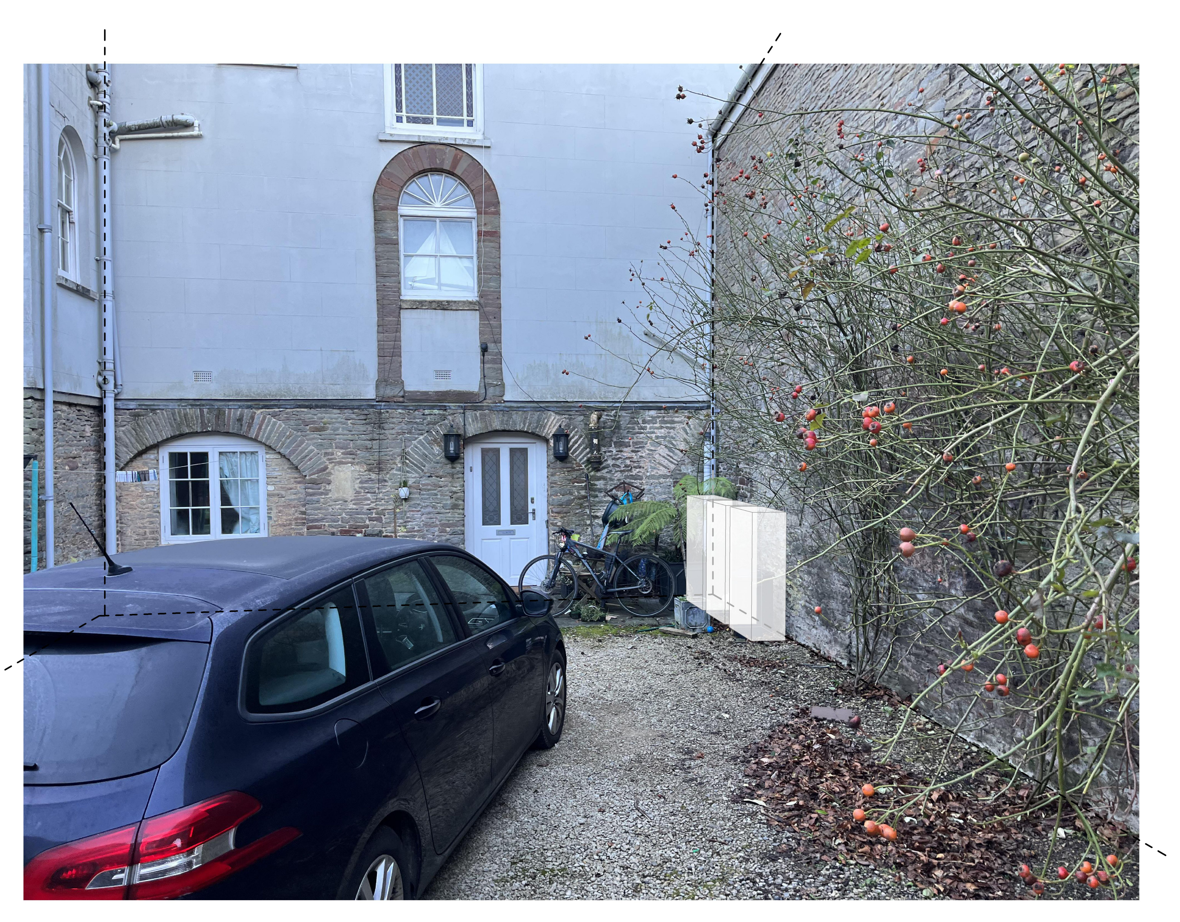
PROPOSED PERSPECTIVE A @ 1:25