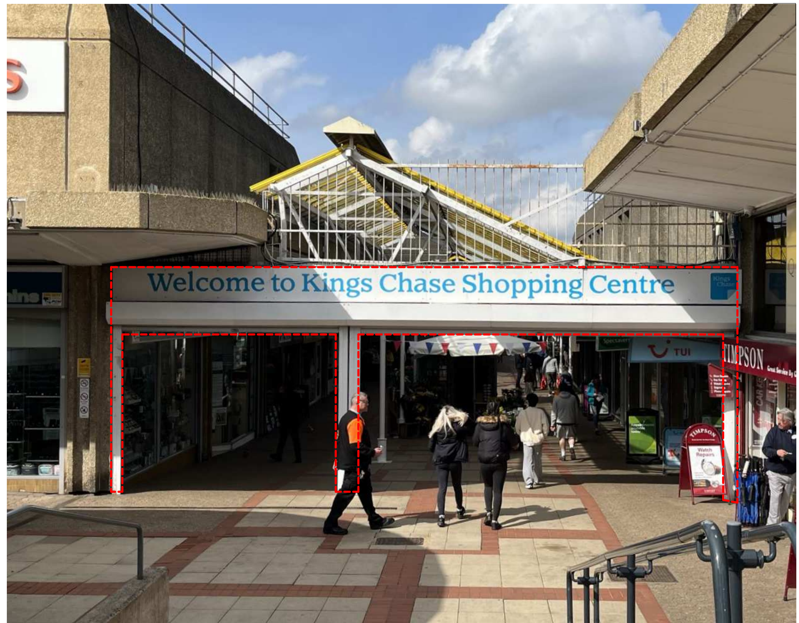
Existing portal site photo