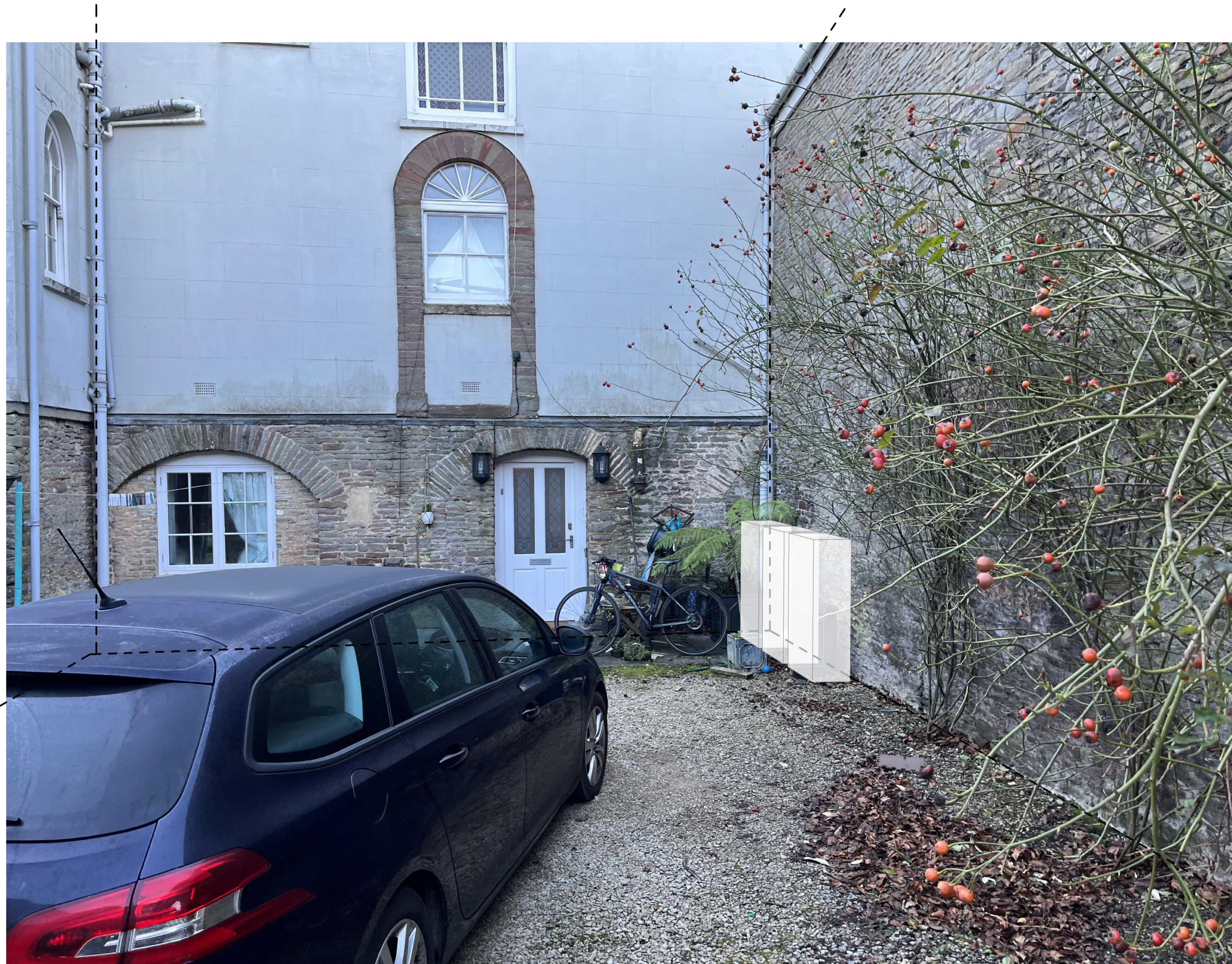
PROPOSED PERSPECTIVE A @ 1:25