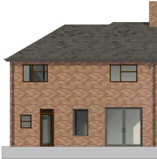
3 Existing Rear Elevation Scale: 1 : 100