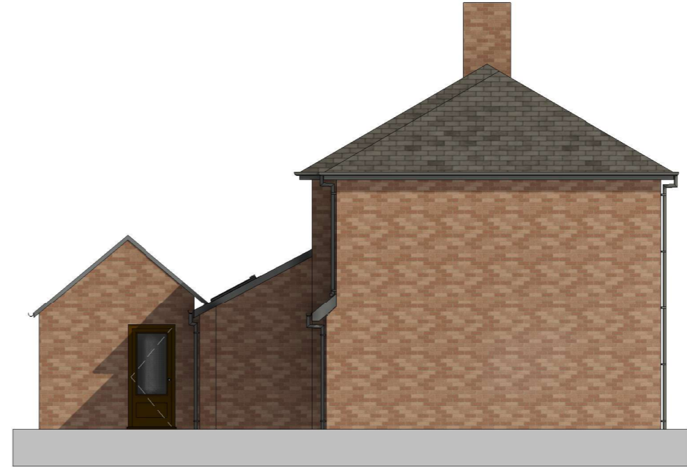
2 Existing Side Elevation A Scale: 1 : 100