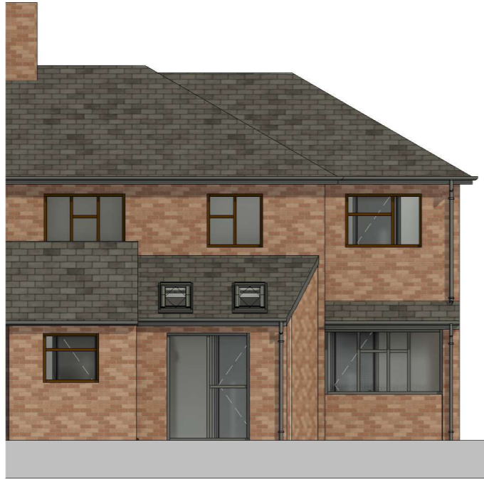
1 Existing Front Elevation Scale: 1 : 100