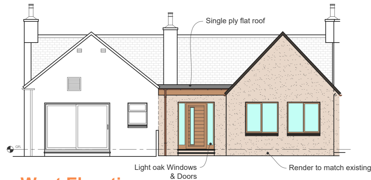
West Elevation 1:100