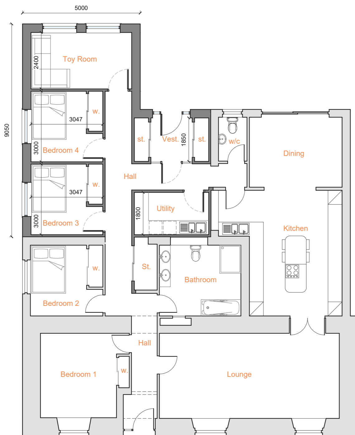
Ground Floor Plan 1:100