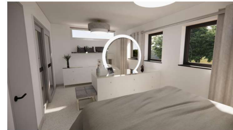
FF Bedroom View 2