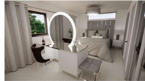
FF Bedroom View 1