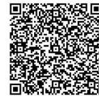
FF Bedroom View 3 With TV