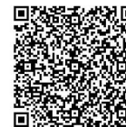
FF Bedroom View 2