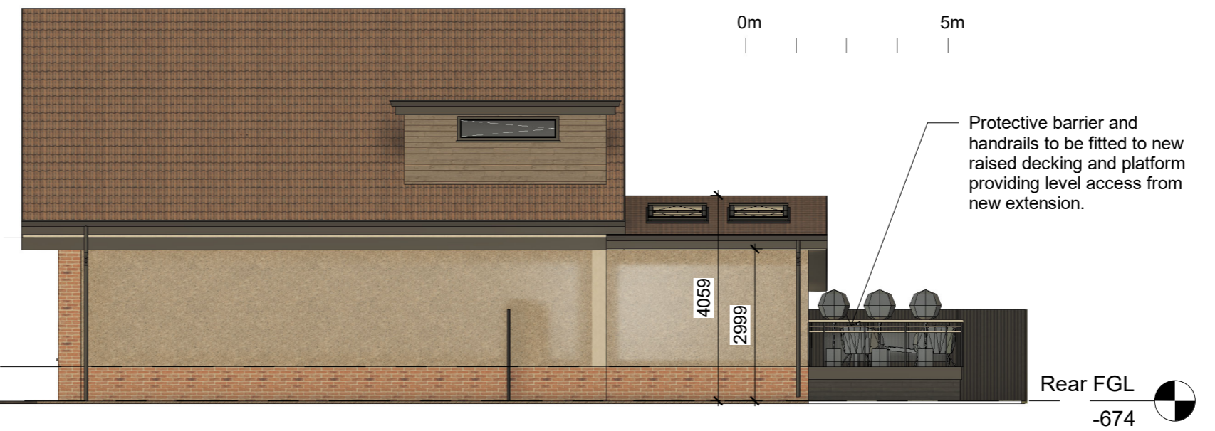
Side Elevation B 1 : 100