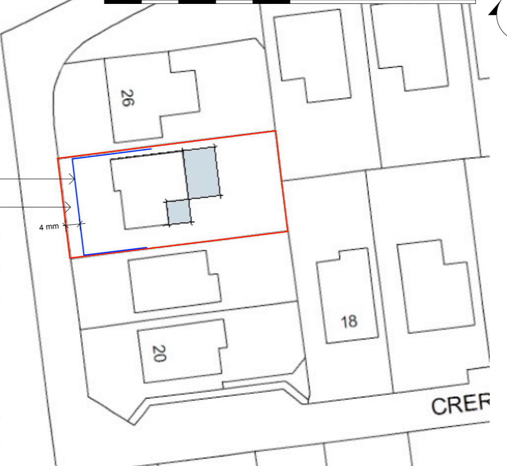
P :: PROPOSED BLOCK PLAN 2 scale: 1:500

PROPOSED NEW WALL FOR MR P. GALLACHER 24 CRERAN CRESCENT GARTCOSH GLASGOW G69 8FR