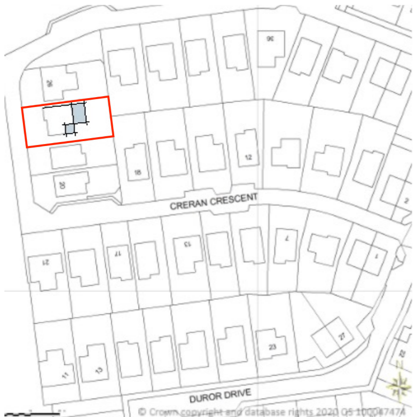
P :: LOCATION PLAN 2 scale: 1:1250