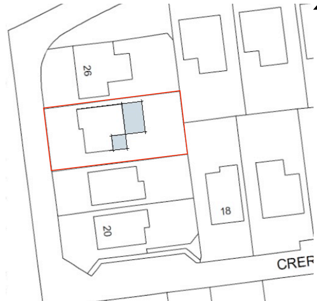
P :: EXISTING BLOCK PLAN 2 scale: 1:500