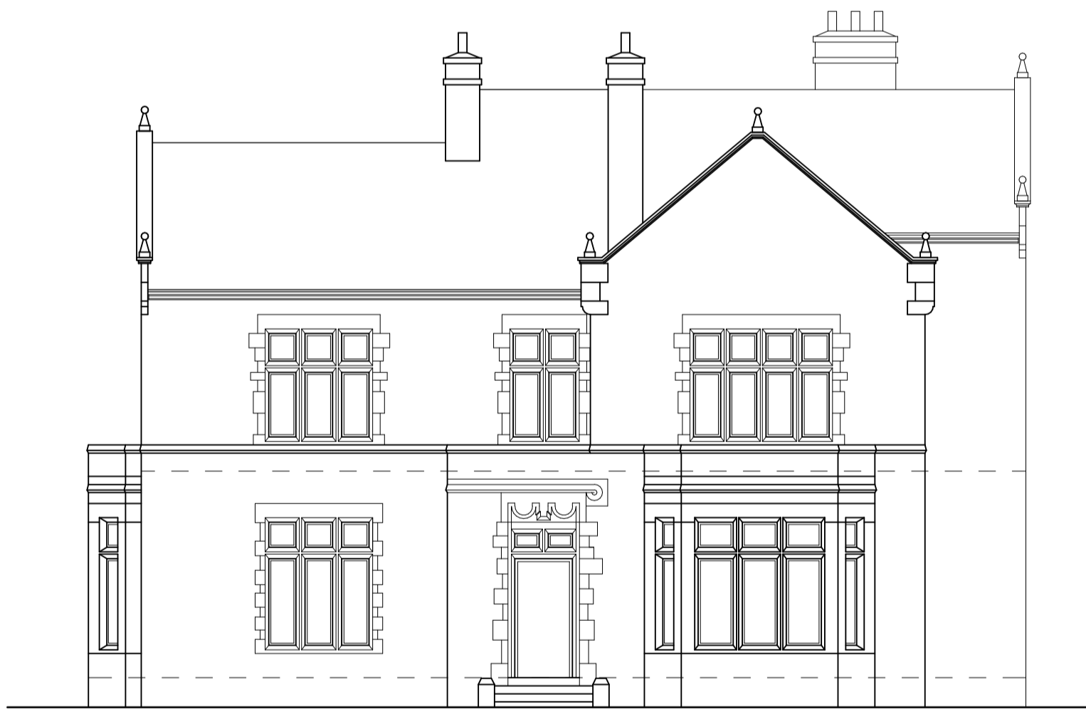
EAST ELEVATION (FRONT)