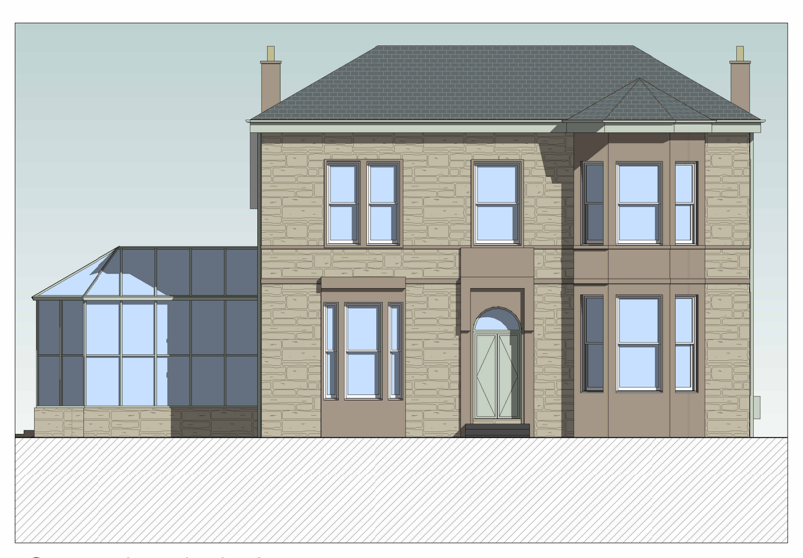
A ELEVATION A - AS EXISTING 1:100