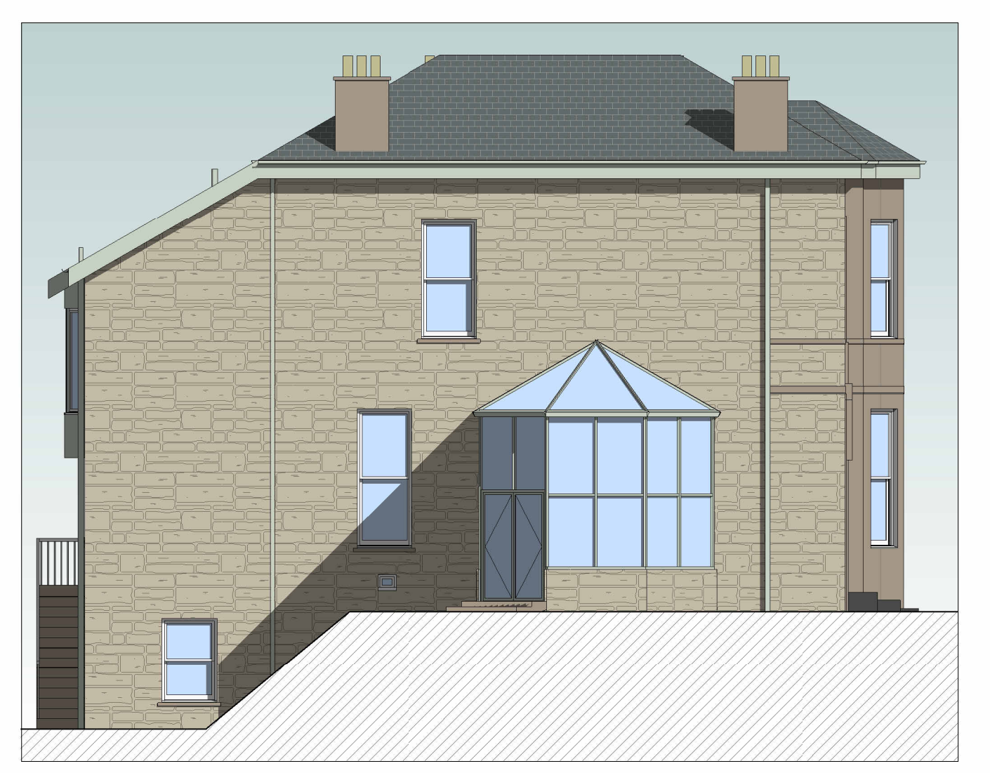
B ELEVATION B - AS EXISTING