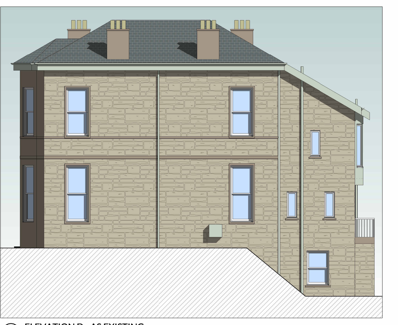
D ELEVATION D - AS EXISTING 1:100

Responsibility is not accepted for errors made by others in scaling from this drawing. All construction information should be taken from figured dimensions only. All dimensions are in millimetres unless otherwise stated. All dimensions to be verified on site before proceeding with the work. Any discrepancies to be notified in writing to Architect immediately