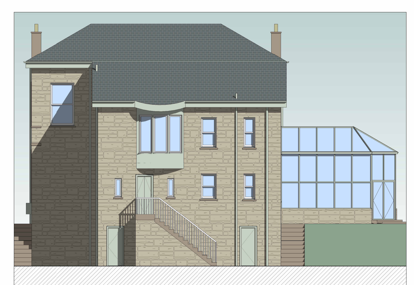
ELEVATION C - AS EXISTING 1:100