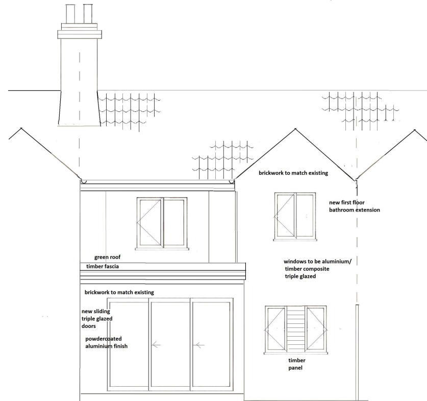
South (Rear) Elevation)