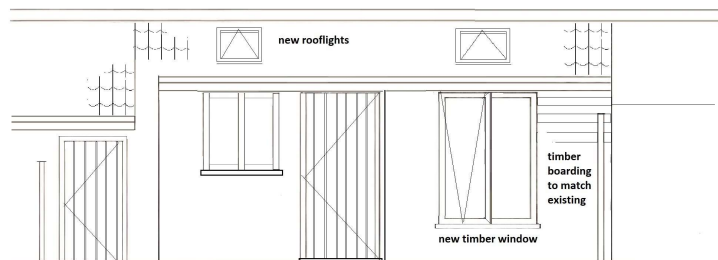
North (Rear) Elevation