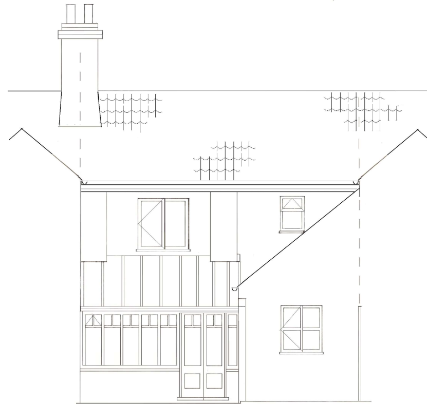
South (Rear) Elevation)