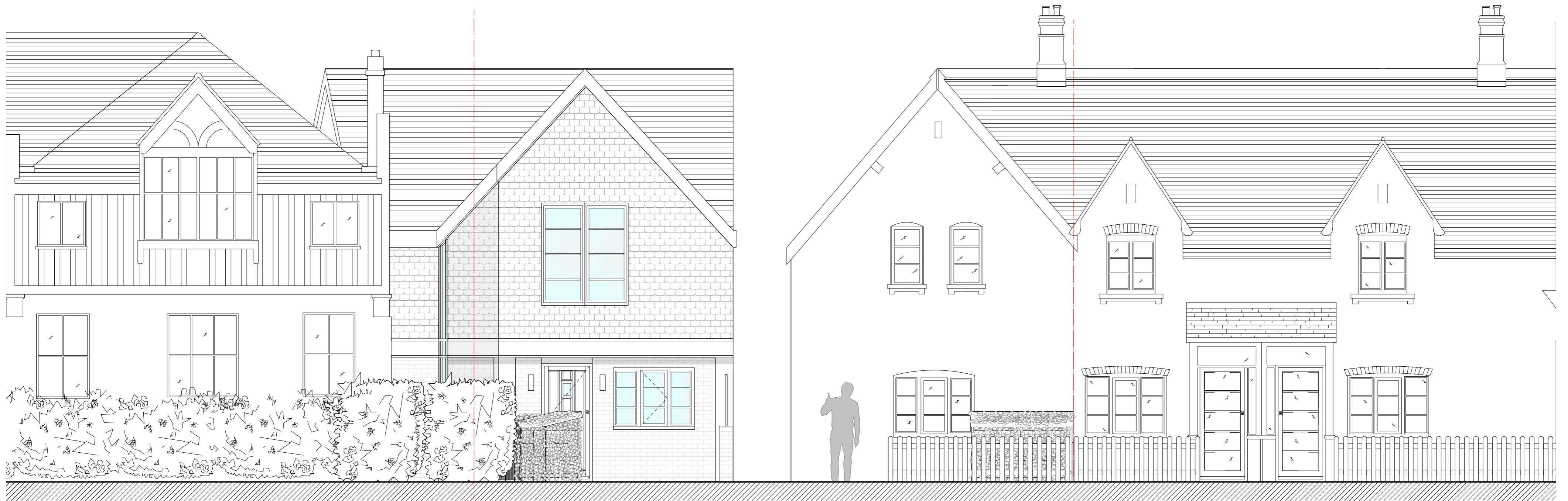
1 Street Scene Elevation Scale: 1:50

Contractors must check all dimensions on site. Only figured dimensions are to be worked from. Discrepancies must be reported to the Architect or Engineer before proceeding. © This drawing is copyright