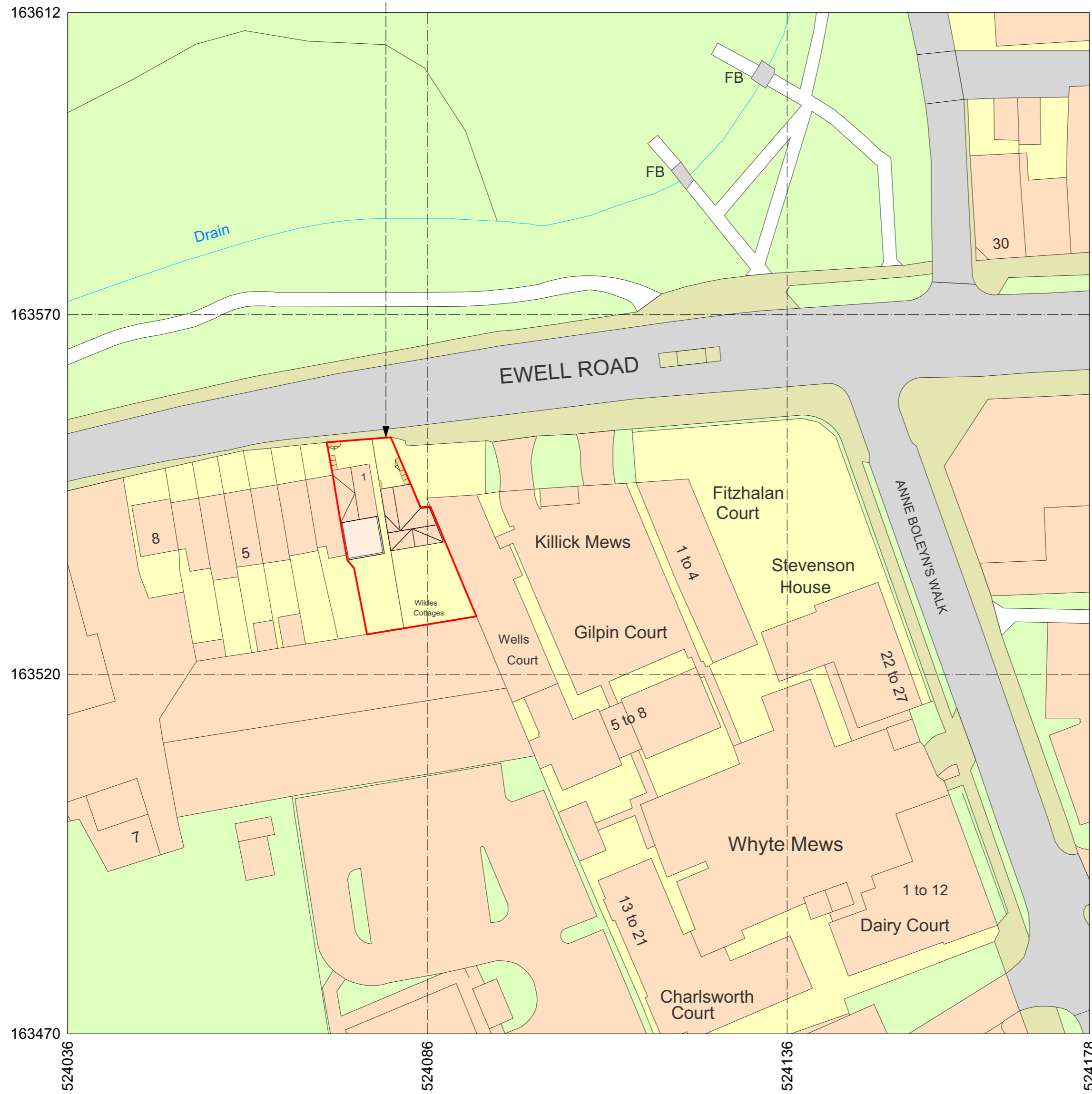
1 Proposed Site Block Plan Scale: 1:500

INDICATED IN RED PROPERTY BOUNDARY OBJECT OF THIS PLANNING APPLICATION.