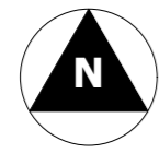
1 Existing Roof Plan Scale: 1:100