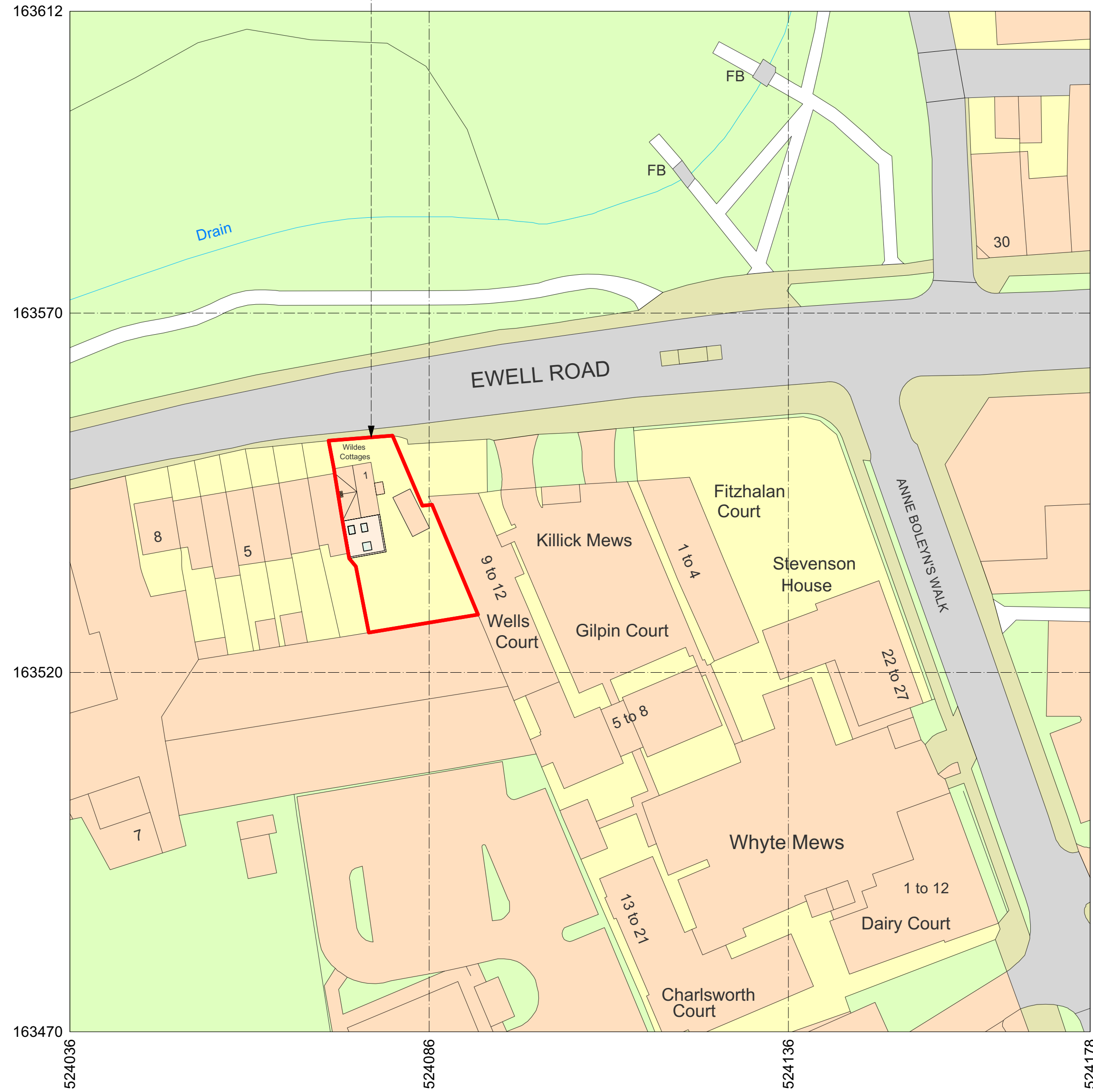
1 Existing Site Location Plan Scale: 1:500

INDICATED IN RED PROPERTY BOUNDARY OBJECT OF THIS PLANNING APPLICATION.