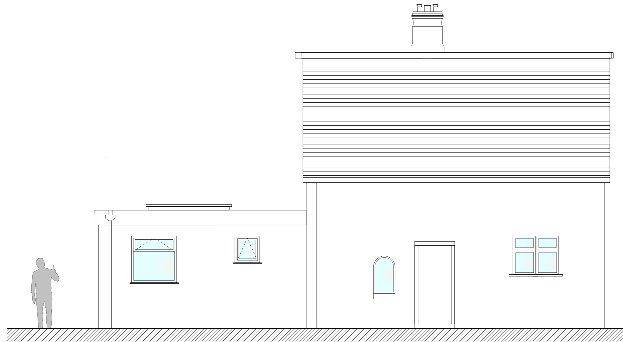
1 Proposed East Elevation for Wildes Cottage Scale: 1:50

Contractors must check all dimensions on site. Only figured dimensions are to be worked from. Discrepancies must be reported to the Architect or Engineer before proceeding. © This drawing is copyright