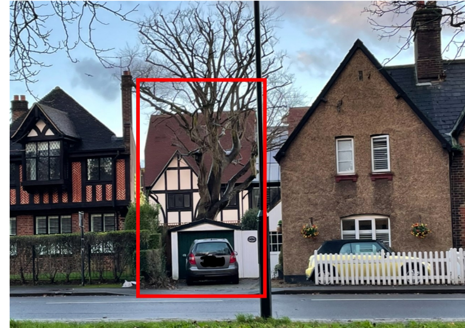
3 Photo to illustrate the gap that this proposal fits into, and what has been built in the space behind