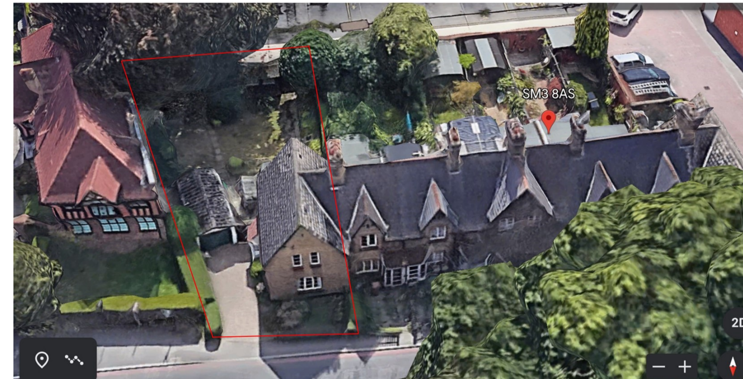
4 Aerial view shows the existing garage which has approval to be demolished.