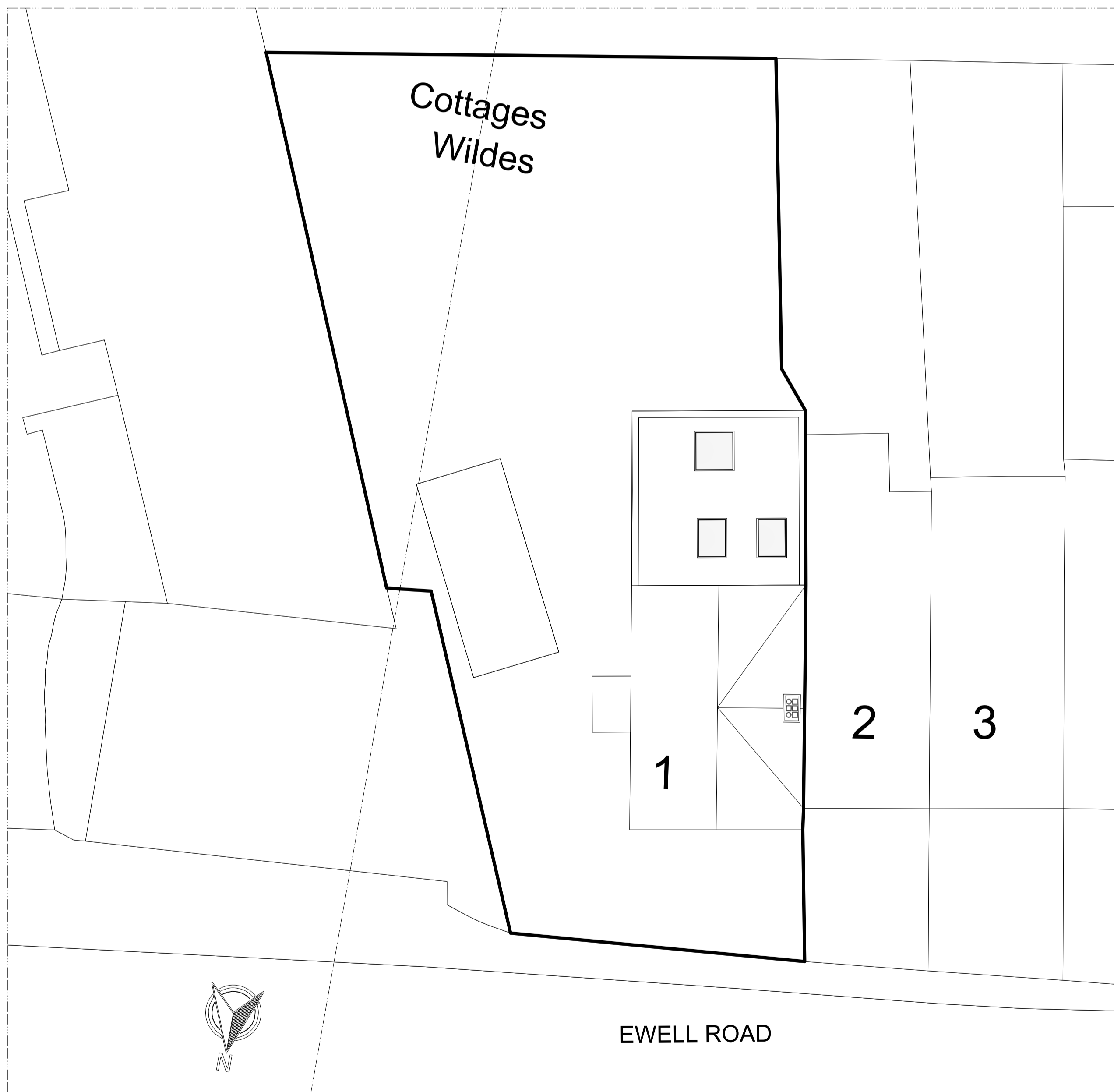
2 Existing Block Plan Scale: 1:100