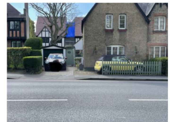
SITE PHOTO. CURRENT CONDITION