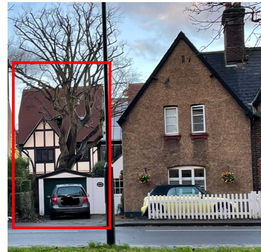
2 Photo of existing & Timber Court's 3 end flats visible in the gap of the proposed. (red line)