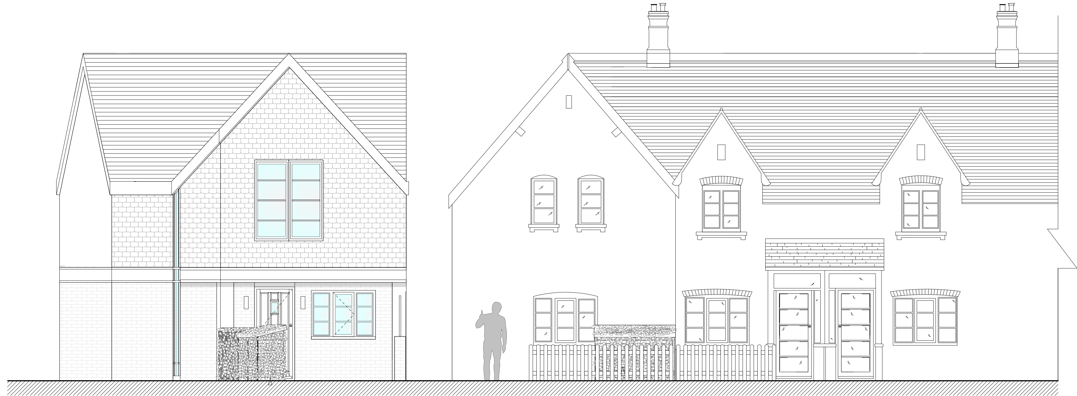
1 Wildes Cottages Combined Front Elevation Scale: 1:50

Contractors must check all dimensions on site. Only figured dimensions are to be worked from. Discrepancies must be reported to the Architect or Engineer before proceeding. © This drawing is copyright